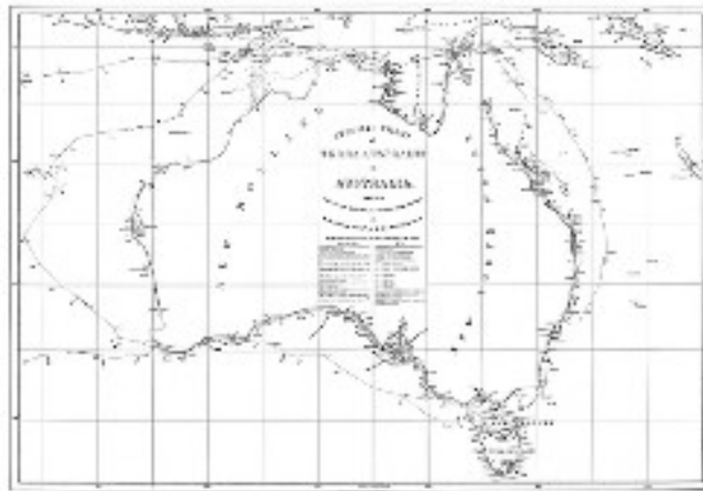
Flinders 1822 Chart of Australia

the first map to name the continent “Australia” that had previously been referred to as “Terra Australis Incognita”. The name “Australia” was subsequently officially adopted for the continent.