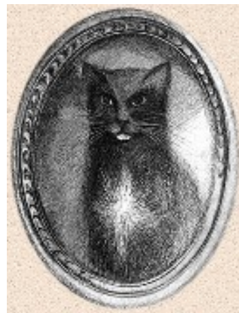
Trim the cat

A valued member of the crew of Flinders survey ship HMS Investigator when charting the coast was Trim the Cat .