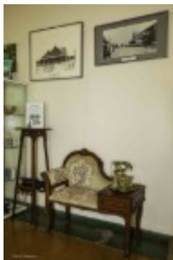
“New” old couch and telephone.