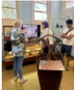
More old things