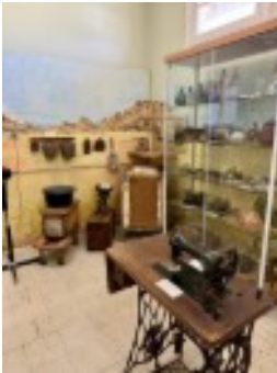
Old Things (that is what a museum is for)