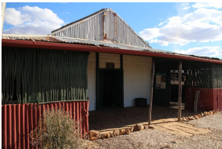
Jones Store, Newcastle Waters https://www.nationaltrustntstore.com/jones-store