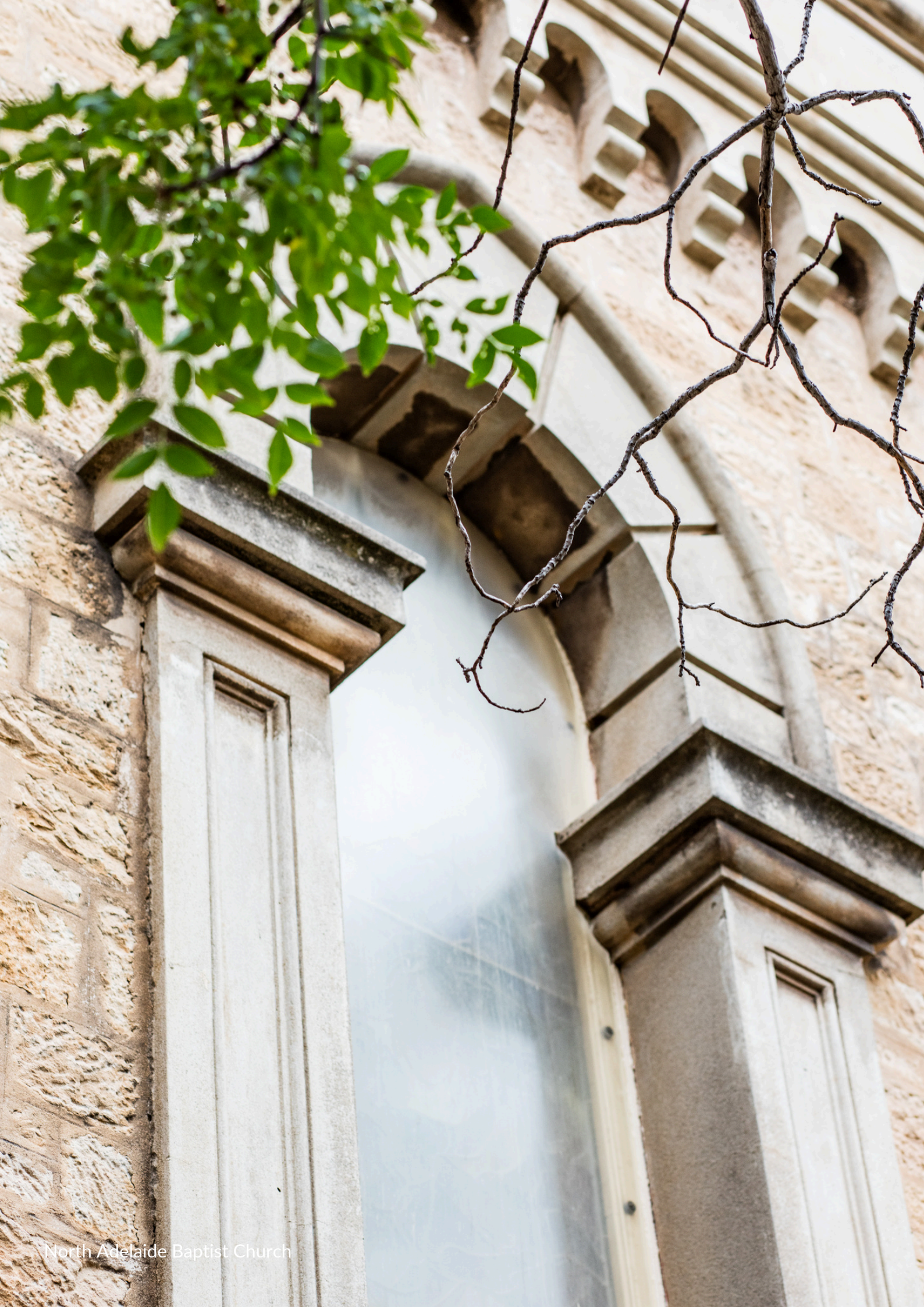
North Adelaide Baptist Church