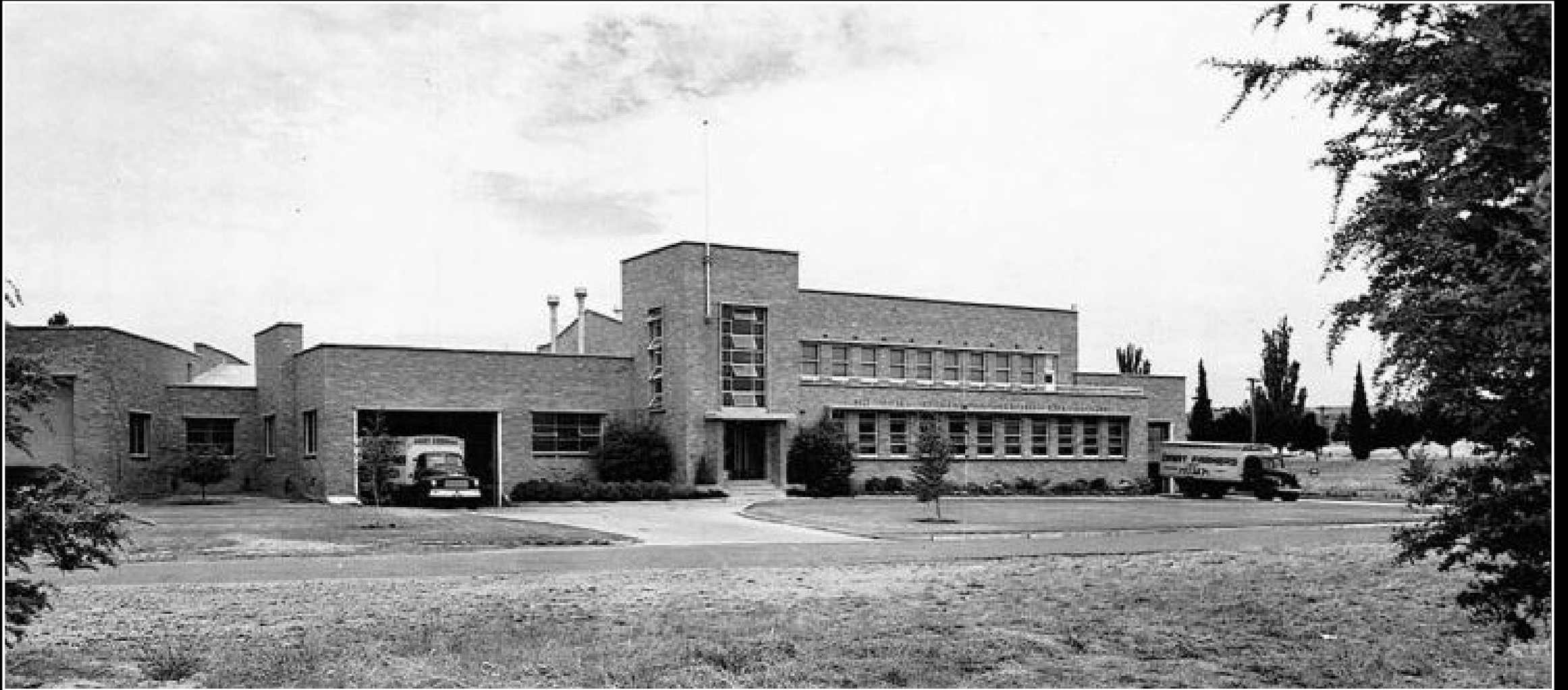
Dairy Producers Depot