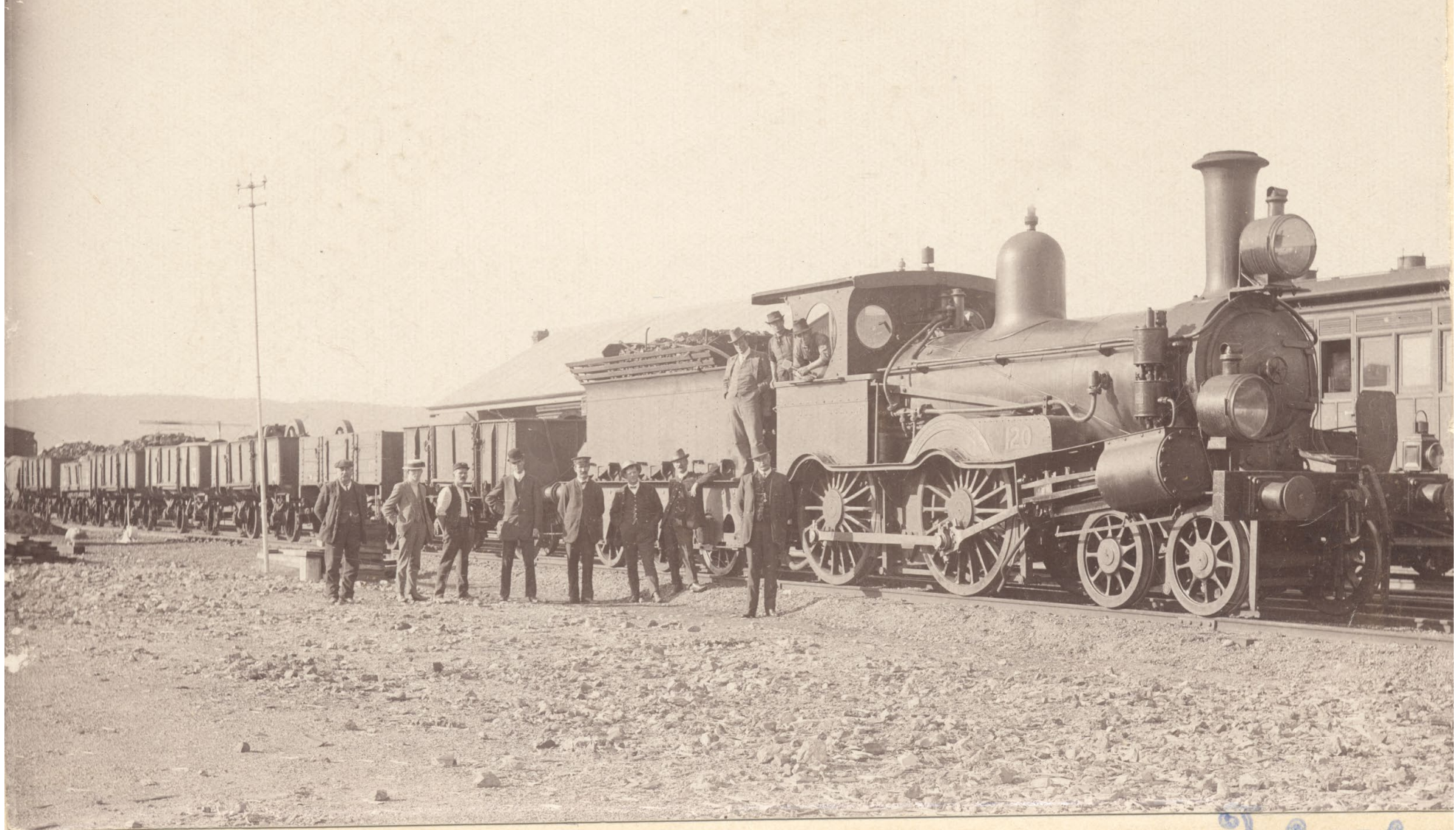
No 120 Engine First Goods Train to Canberra May 25 th 1914