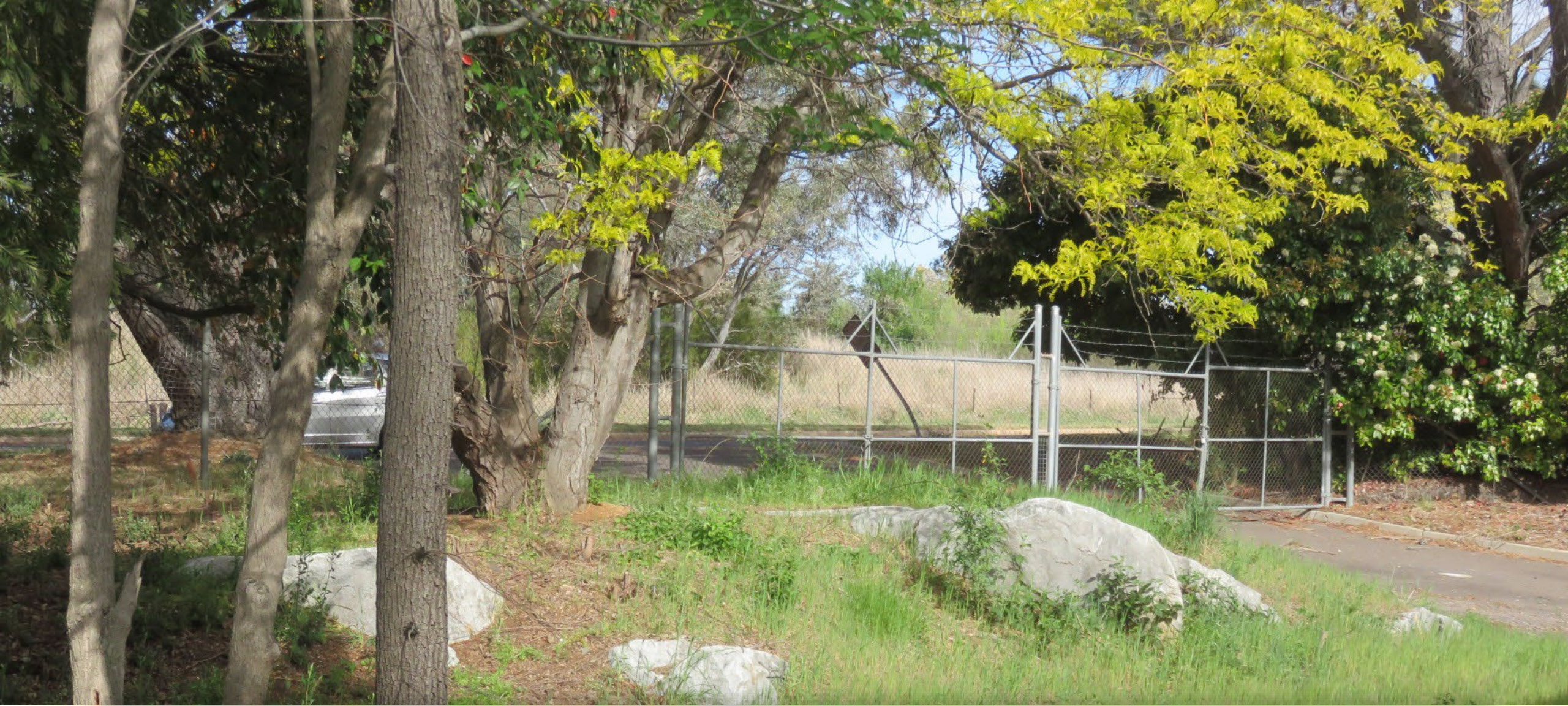
Eyre Street Limestone