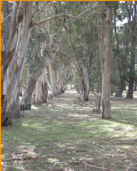
Hackett Community Association

Hackett: 50 years plus Story of a North Canberra suburb