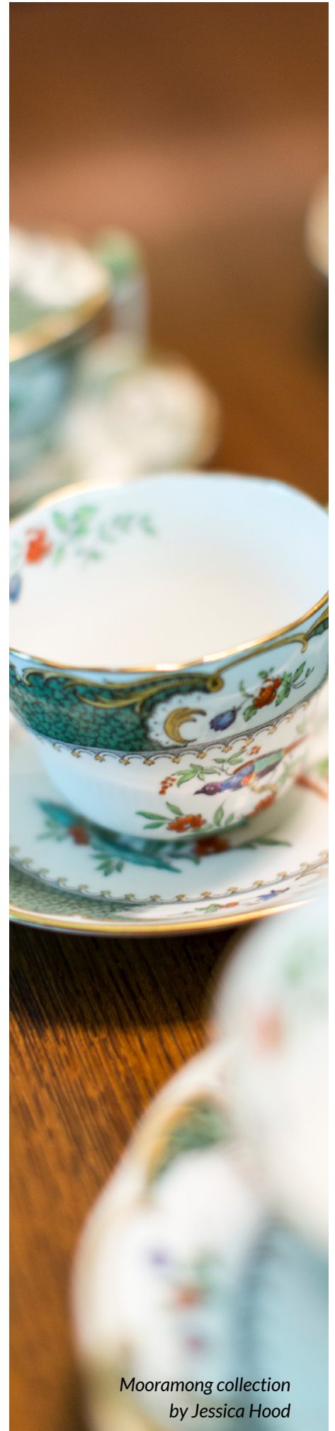
Mooramong collection

Most of the 39 properties and some 35,000 items entrusted to the National Trust in Victoria are not accompanied by funding for future preservation. Without the support of a Foundation to hold funds for this purpose, National Trust properties and collections could be at risk.