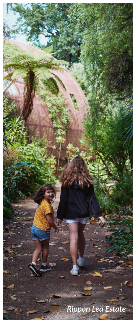
Rippon Lea Estate

If you join us in supporting our work you will be reaching out and touching the hearts and minds of the future."