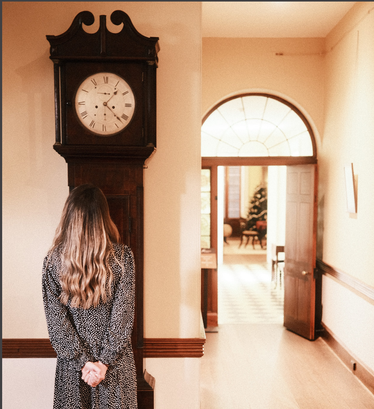
Oatley Clock, Old Government House Front cover: Aerial view of Old Government House