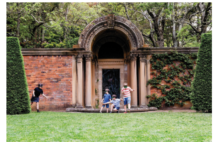
Everglades House & Gardens