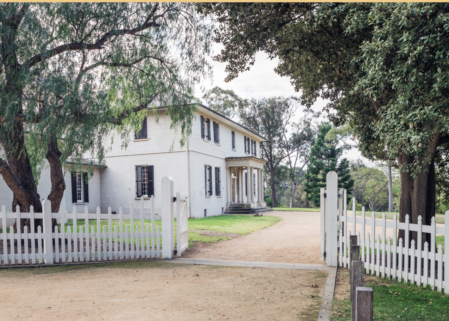
Old Government House entrance

This elegant Georgian house stands in 200 acres of parkland, overlooking the Parramatta River