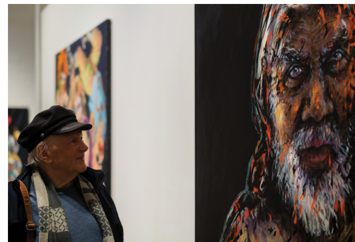
S.H. Ervin Gallery