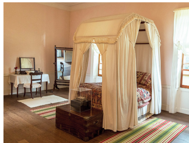
Explore the Governor's private rooms with our expert guides