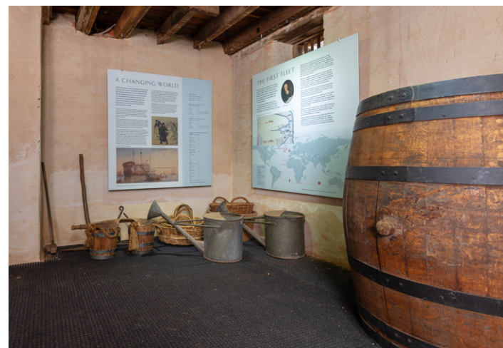
Experiment Farm Cottage

nationaltrust.org.au/places/woodford-academy