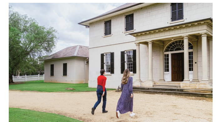
Walking to the entrance of Old Government House.

Old Government House is a 10 - 15 min walk from Parramatta Station or Parramatta Ferry Wharf.