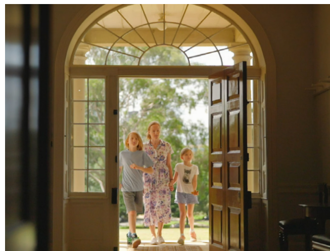
Be welcomed into the house at the grand front entrance

Property guide books are available for group visitors at a reduced price of $5 (usually $10). Full of interesting facts and images the guide book make a nice souvenir. If you visit both Old Government House and Experiment Farm Cottage you can purchase both guide books for just $9.