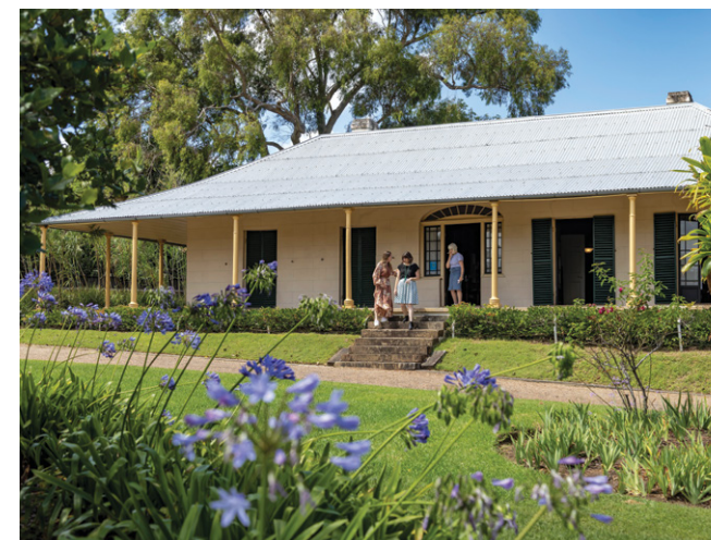
Experiment Farm Cottage