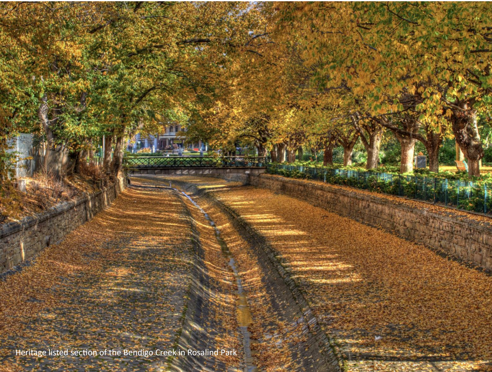
Heritage listed section of the Bendigo Creek in Rosalind Park

A publication of the National Trust Bendigo & District Branch. February 2024