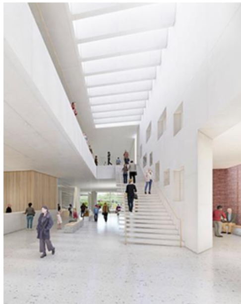
Artist impressions of the atrium looking through to Rosalind Park. Image: City of Greater Bendigo

The Branch further submits that the proposed new gallery in size, style and scale, would detract from the landmark qualities of the significant heritage building, including important views from View Street and Rosalind Park.