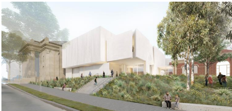
Artist impressions of the exterior impact on View Street.

However, it is the role of the National Trust of Australia (Victoria) and our Bendigo and Region Branch to explore development applications and how we believe that proposed works could impact on the overall heritage nature of our city.