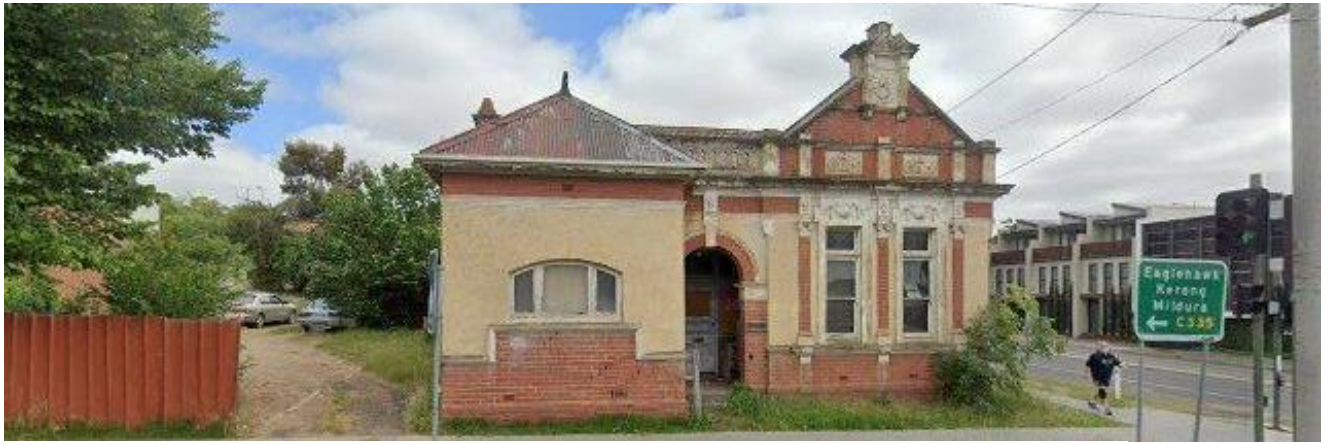
202 Barnard Street Bendigo, once the surgery and residence of a local doctor.