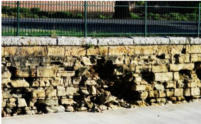
Example of deteriorating wall, this one sandstone with granite capping.

(d) The obvious current deteriorations of the heritage fabric beds and walls of the subject creeks. (Note: Example 1 – many areas of the creeks' bluestone blocks are CLEARLY deteriorated in regards to mortar holding them together; it appears that this may have possibly originated from when Coliban Water put in a pipeline in circa 1990s); Example 2 – there are many areas where the fabric has deteriorated and requires urgent maintenance, however, there appears that virtually NOTHING is being done.)