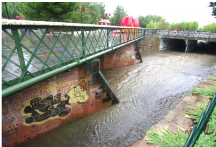
Bendigo Creek through Rosalind Park and Conservatory Gardens. In flood 7 Jan. 2024.

(d) The obvious current deteriorations of the heritage fabric beds and walls of the subject creeks. (Note: Example 1 – many areas of the creeks' bluestone blocks are CLEARLY deteriorated in regards to mortar holding them together; it appears that this may have possibly originated from when Coliban Water put in a pipeline in circa 1990s); Example 2 – there are many areas where the fabric has deteriorated and requires urgent maintenance, however, there appears that virtually NOTHING is being done.)