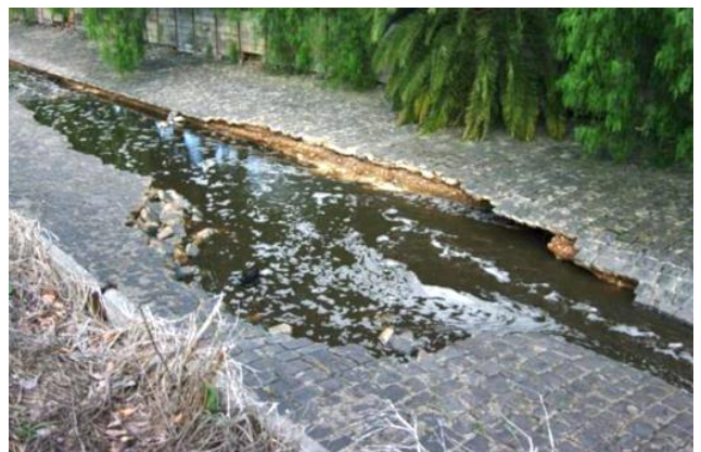
Bendigo creek bed bluestone blocks broken away and washed downstream. 9 Jan 2024.