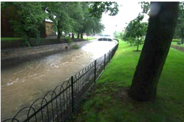
Bendigo Creek through Rosalind Park, on the Victorian Heritage Register.

(c) The CGB Council's failures and or refusals to undertake such a study as outlined in (b) (and its refusals to respond or adequately respond to my public letters for same).