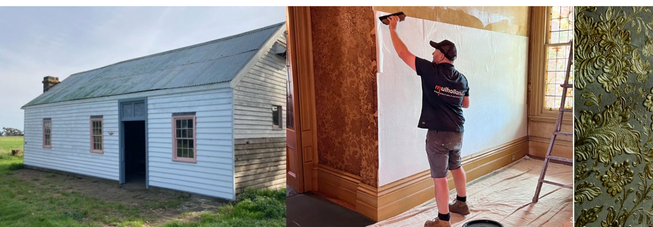
Before and after - Foundation supported Kinkanarami wallpaper restoration at Rippon Lea Estate

Before and after - Foundation supported stables restoration at Mooramong.