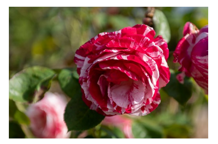
There is something to charm and delight garden enthusiasts across the seasons