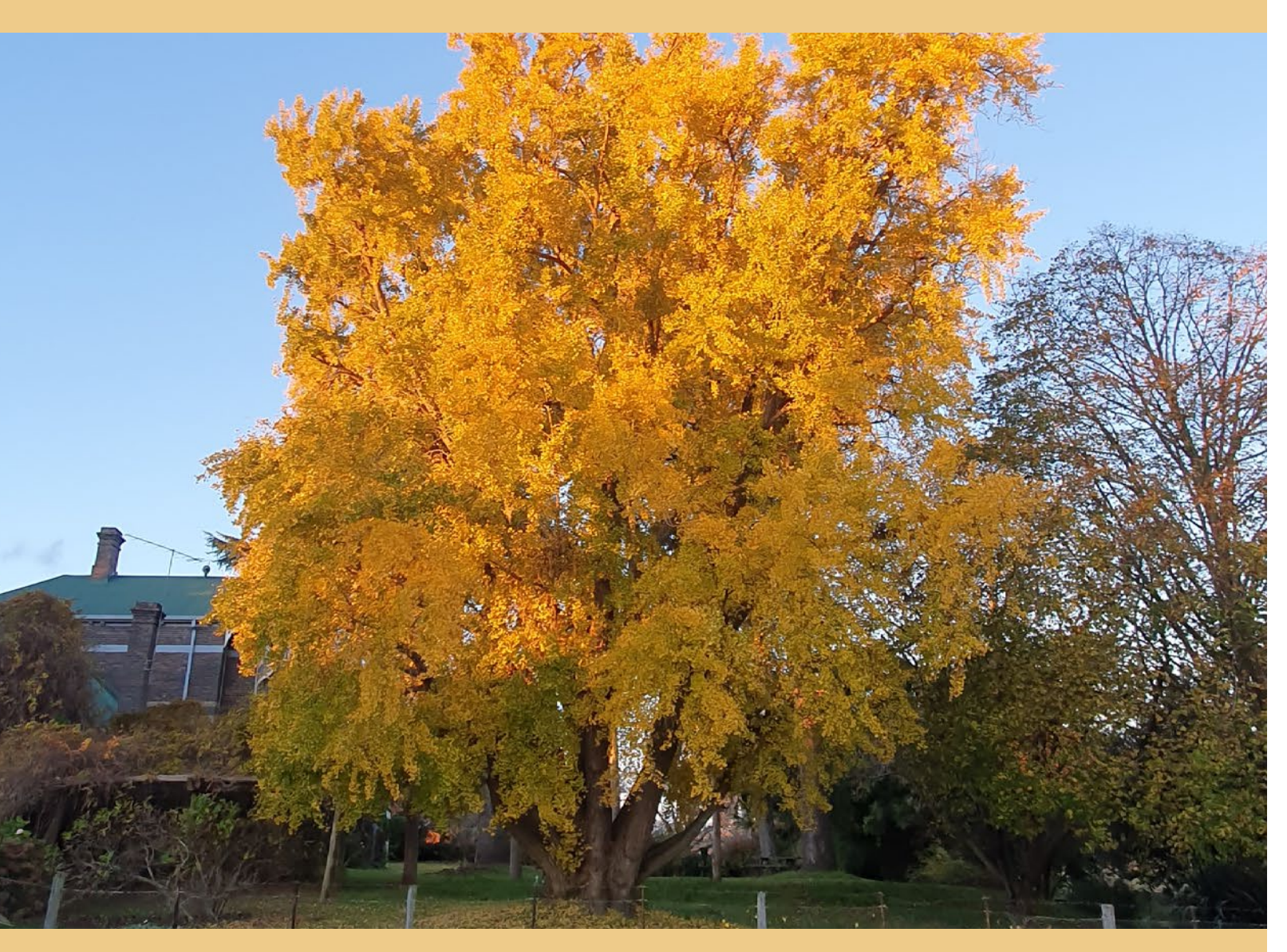
The autumn colours of the Ginkgo biloba at Saumarez Homestead

The magnificent 30 room mansion sits in two hectares of English style gardens with towering centenarian trees