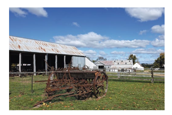
The Saumarez Homestead farm buildings date back to the 1830s % \left( {{{\rm{AS}}} \right)