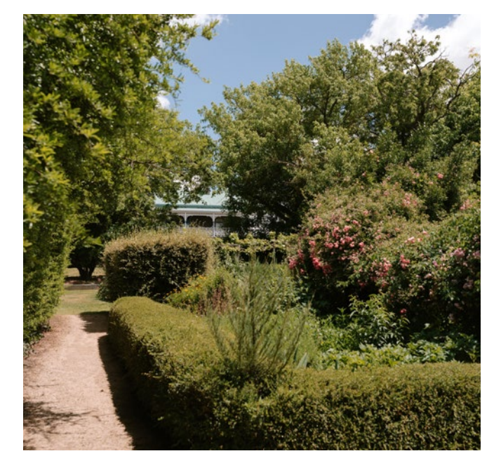
Mary's Cottage Garden