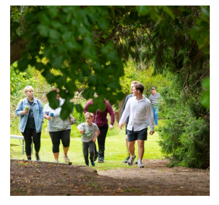
Visitors enjoying the gardens