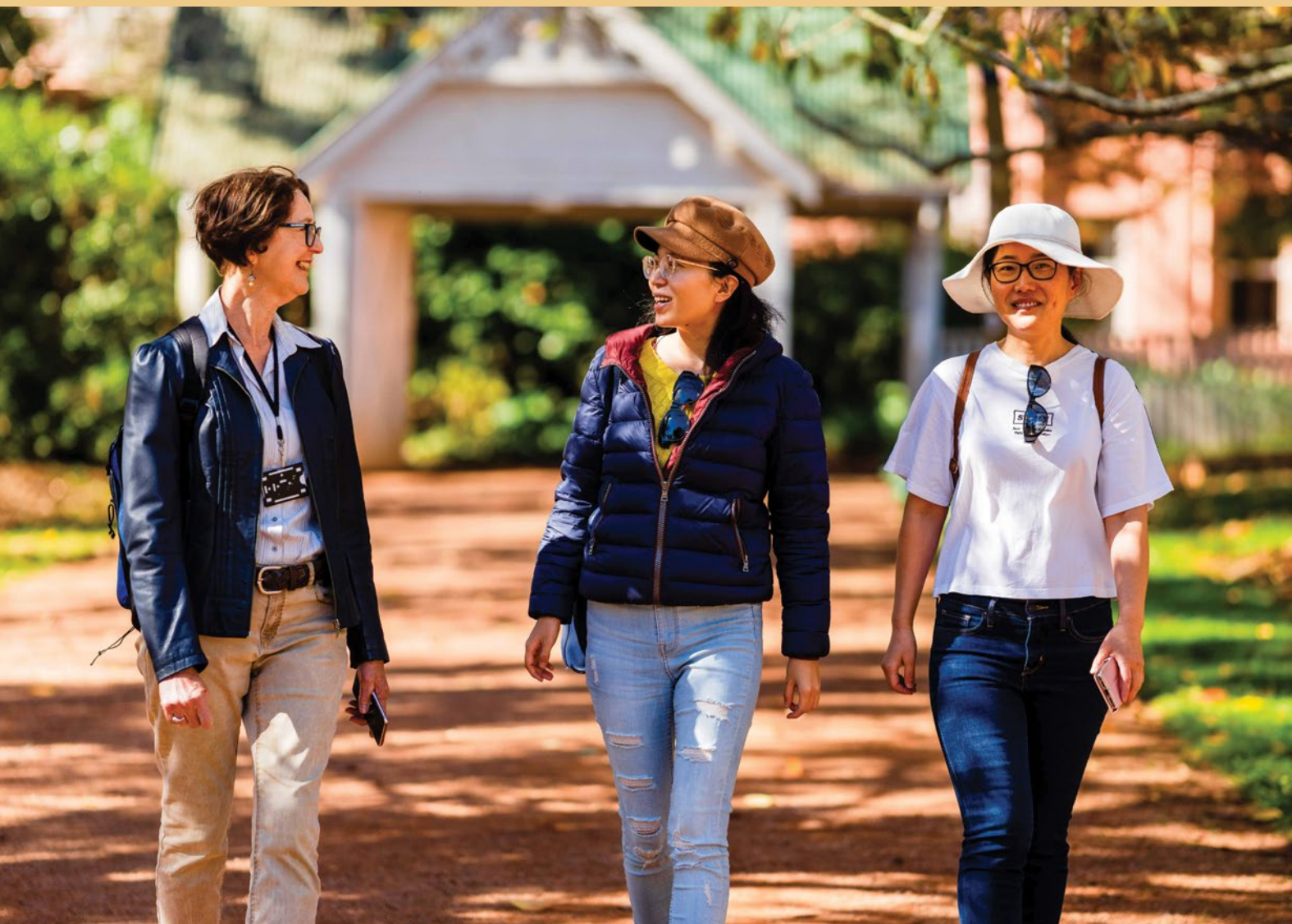
Visitors enjoy the gardens at any time of year

Built in the 1880s, Retford Park is a place of great heritage significance and natural beauty