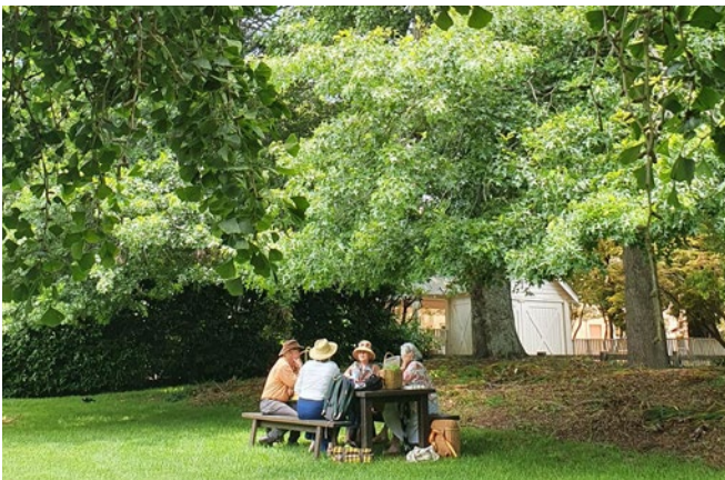
There is something to charm and delight garden enthusiasts and young explorers all seasons of the year