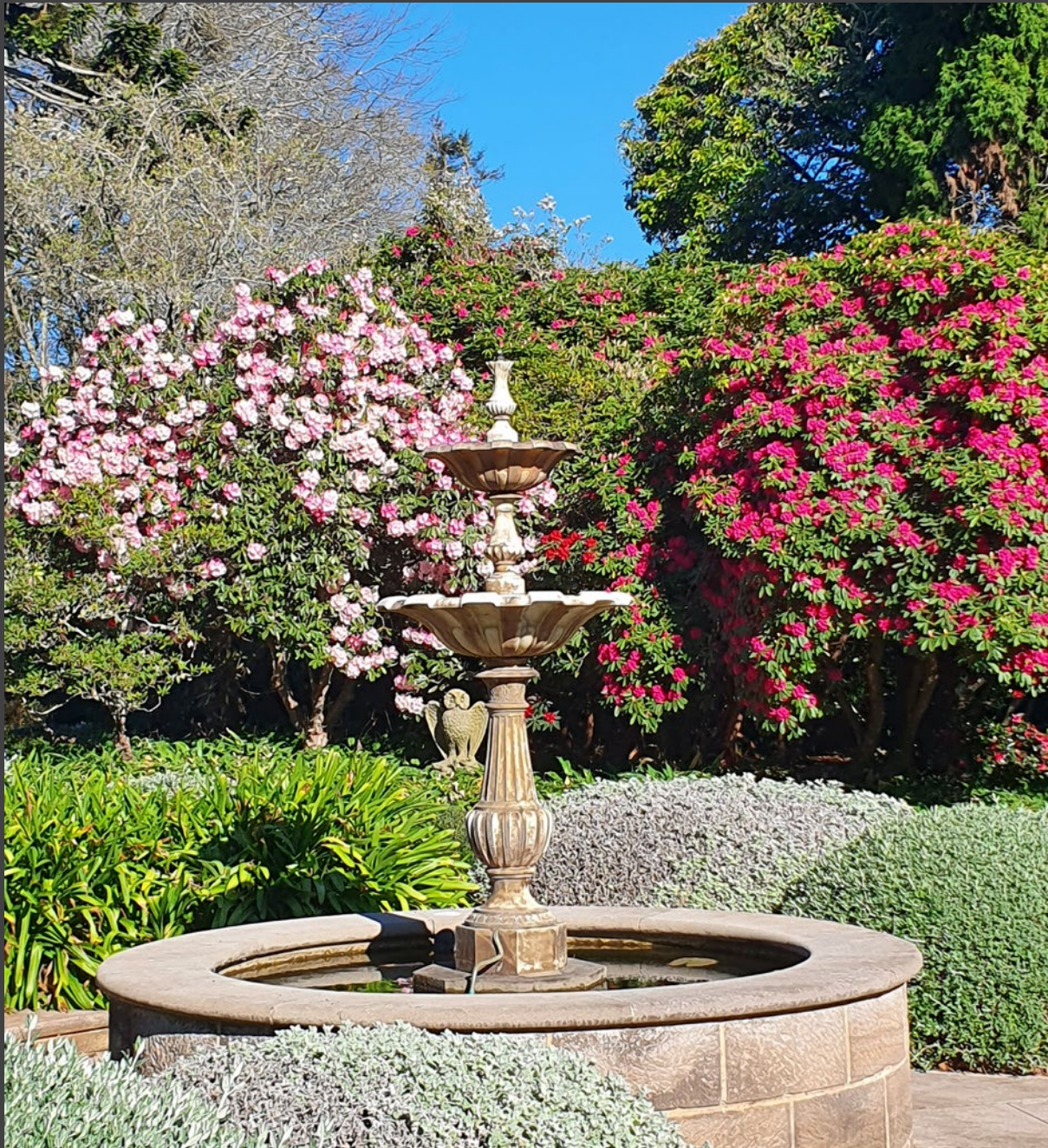
Teardrop garden fountain