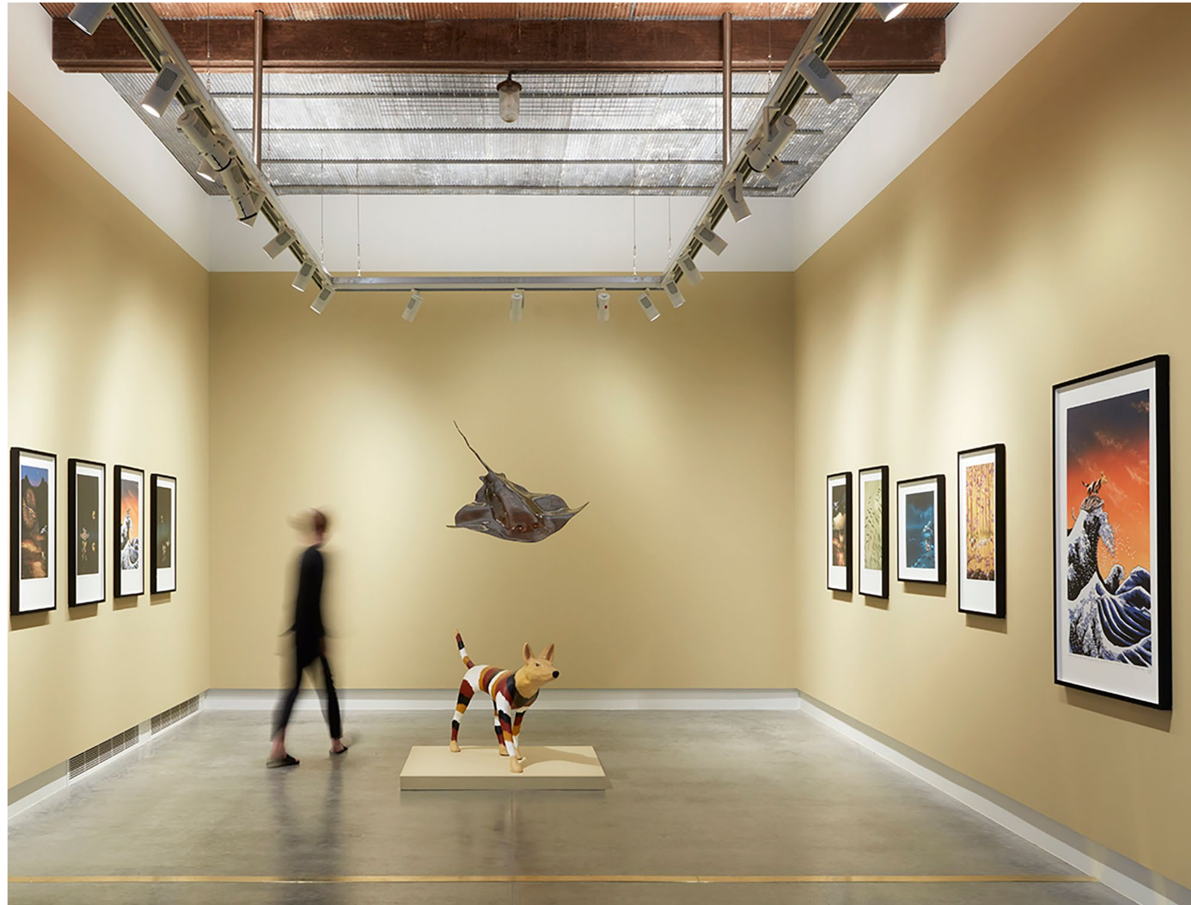
Ngununggula, the Southern Highlands Regional Gallery. (Photo by Tonkin Zulaikha Greer Architects).

Harper's Mansion (02) 4877 2071 harpersmansion@nationaltrust.com.au nationaltrust.org.au/places/harpers-mansion