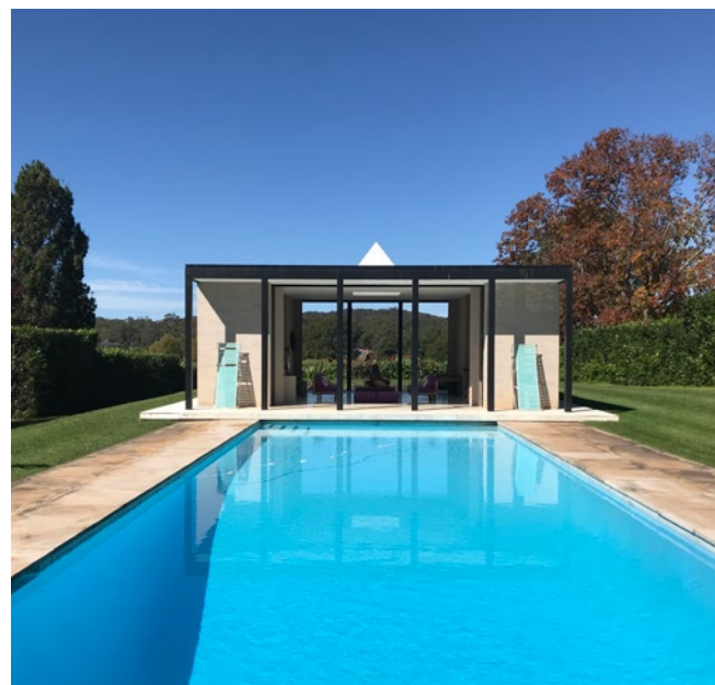
Pool Pavilion designed by renowned modernist architect Guilford Bell