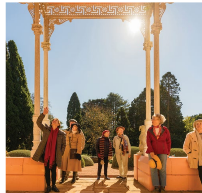
House tours led by passionate guides