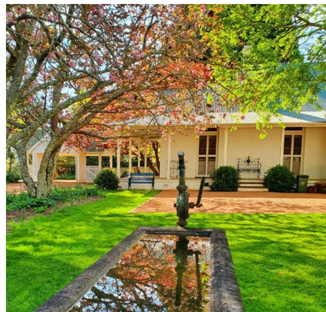
Discover an array of gifts and keepsakes at the White Cottage Gallery and Shop