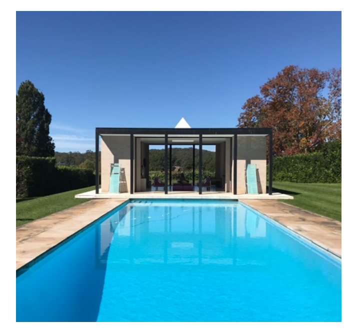
Pool Pavilion designed by renowned modernist architect Guilford Bell