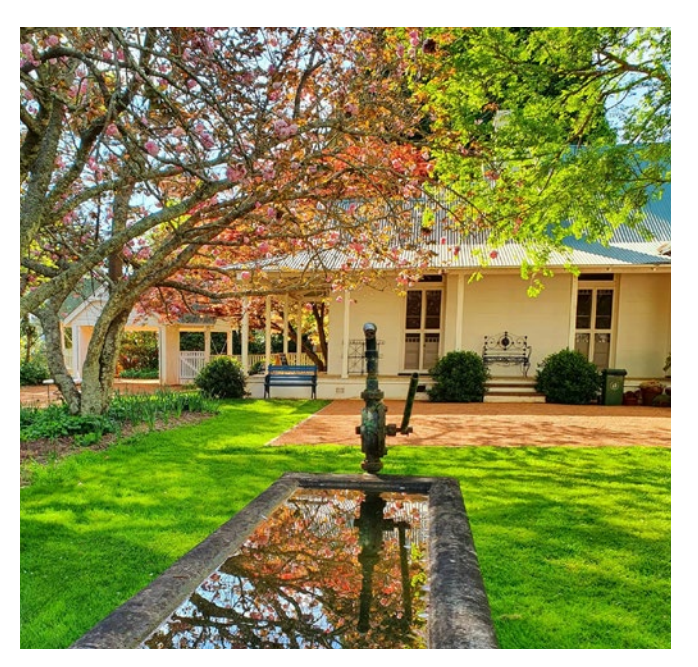
Discover an array of gifts and keepsakes at the White Cottage Gallery and Shop