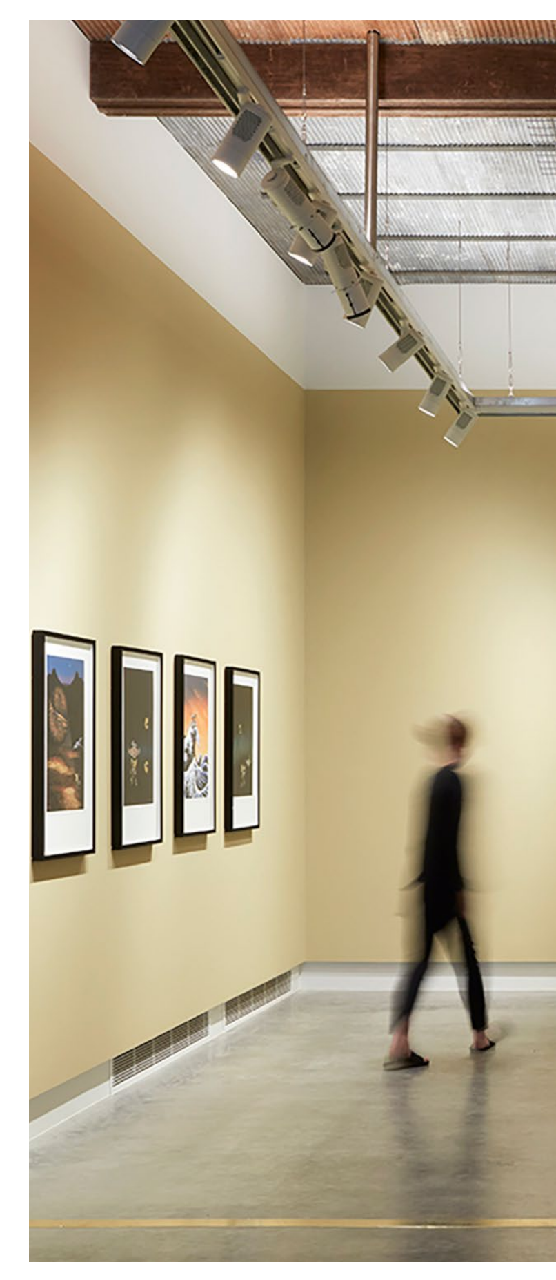
Ngununggula, the Southern Highlands Regional Gallery.

(02) 4877 2071 harpersmansion@nationaltrust.com.au nationaltrust.org.au/places/harpers-mansion