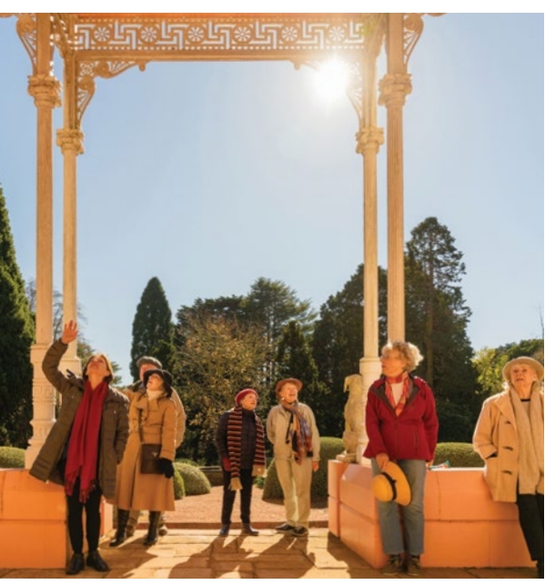
House tours led by passionate guides