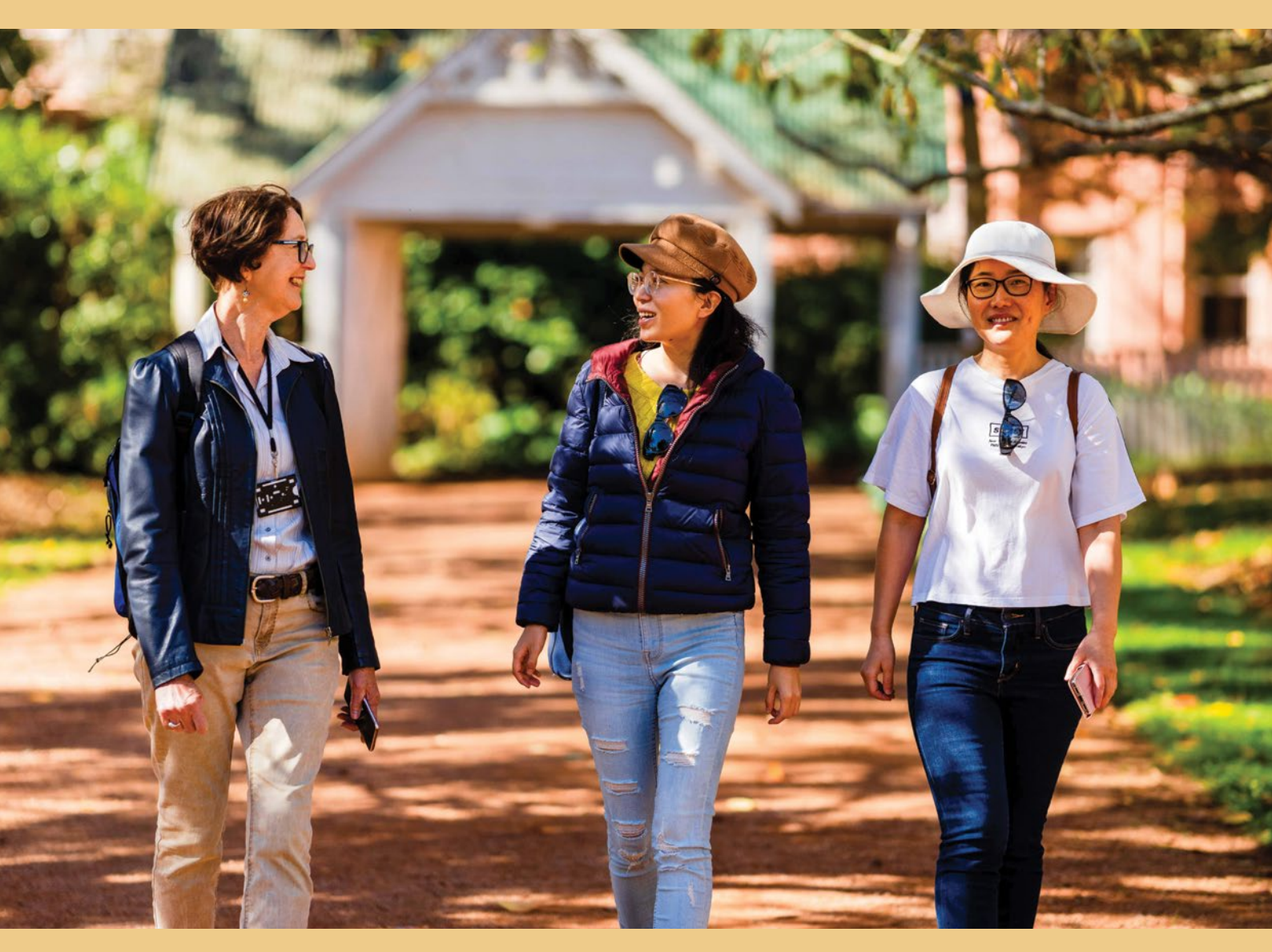
Visitors enjoy the gardens at any time of year

Built in the 1880s, Retford Park is a place of great heritage significance and natural beauty