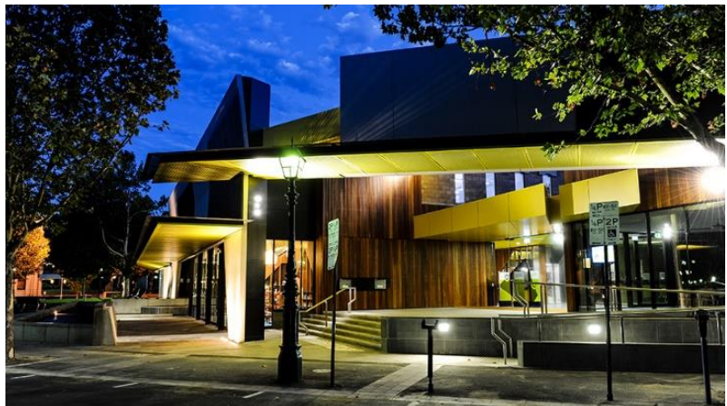
Hargreaves Street entrance to the Bendigo Library

The Branch will meet at the Bendigo Library on the fourth Tuesday of each month at 5.30pm between February and November in meeting room 1. You enter via the Hargreaves Street entrance. We have met for many years at the Shamrock Hotel but the new leaseholders have encouraged us to find an alternative venue.