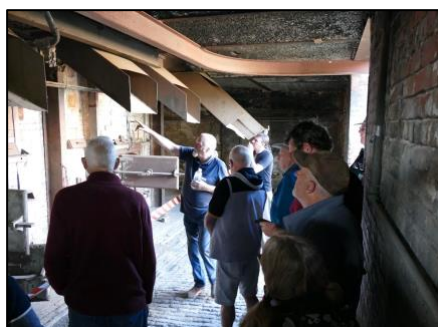
Bendigo Gas Works Tour Saturday April 29. Images: Bendigo Branch