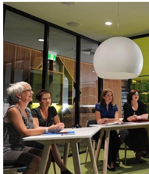
Comfortable meeting space

What do you think? Come along to next meeting and express your views.