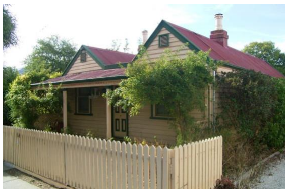
Historic Kangaroo Flat cottage at 14 Lockwood Road.

Two properties come to mind. As Bendigo has its first built house, Specimen Cottage, which is protected, Eaglehawk also has a first built house at 92 Victoria Street which is not protected and dates back to the 1850s. Kangaroo Flat also has a cottage at 14 Lockwood Road which has had many roles both as a business and residence dating back to the 19th century. When will these properties be assessed along with others? And a final question: Is the Council listing all submissions on its website? This would encourage discussion which the Branch strongly supports.