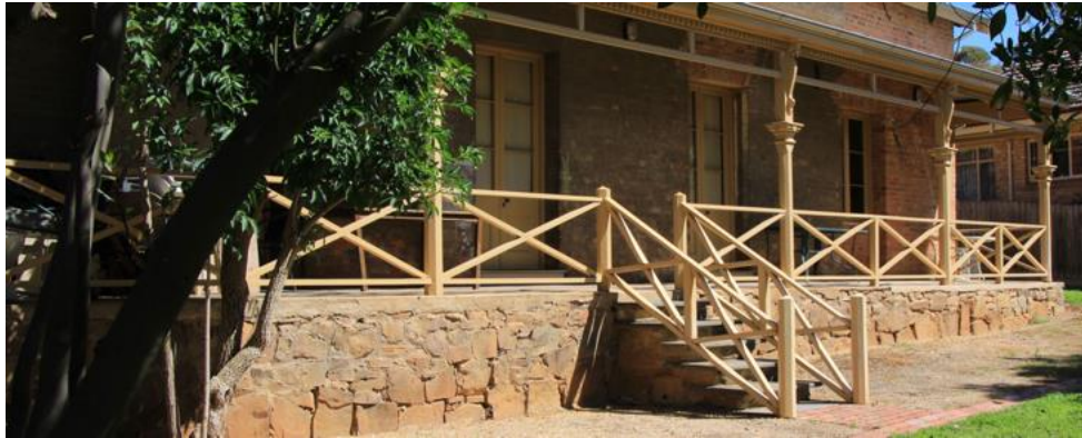
Former Court House, 1852. Home of the Castlemaine Historical Society.