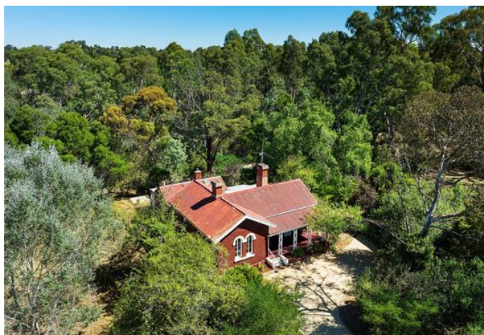
Sheriff Richard Colles' House, Camp Crescent Castlemaine. VHD B2837.

CASSOC provided a splendid morning tea in the Reserve where the group discussed the development plans. While not opposed to a site upgrade, was it possible to lessen the impact of the landscaping and building works on the heritage asset of the Camp Reserve?