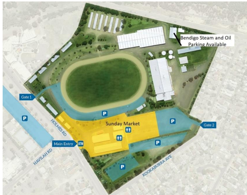
Map showing location at the Showgrounds