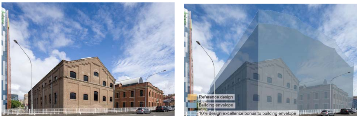
Figure 4: Before (left) and after (right) views of the visual impact from Pier Street. (Visual impact Assessment)

Another example is the view from Pier Street which describes (p.46) the “almost monumental, large scale and bulk of the Powerhouse” which is “visually dominant”, yet then concludes (p.65) that this same view has “negligible” significance and an “imperceptible” magnitude, with the planning envelope having a “perceptible” impact. Despite being taken from the roadway (itself being the way most people will view the site from this location) the report mentions the “distracting nature of the elevated road viaduct in the foreground”.