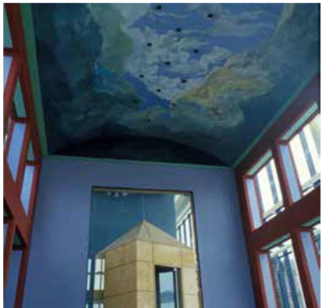
Figure 5: No images of the original design and presentation of the 1988 Powerhouse Museum, including for some of its most significant (and now sadly altered) spaces are included in the Draft CMP. The original quality of presentation, materials, spatial planning and design intent can only be revealed through such inclusion.