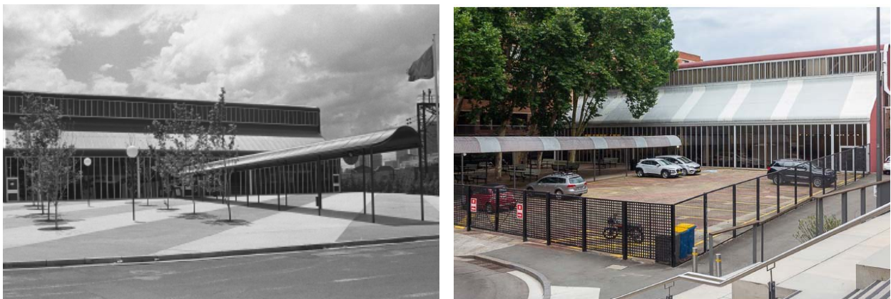
Figure 6: The original entry to the Harwood Building (left) and its current state (right).

The conservation policies within the document are insufficient, and heavily focused on the archaeological and industrial values of the site, rather than the actual museum and built components of the site. For example, there are more specific policies relating to the water-cooling system and manifold than there are for the entire Wran Building. The document also gives little, if any, guidance to how the site should be interpreted and understood in the future. For example, the complete destruction of the original pedestrian plaza and entry to the Harwood Building, now replaced by a fenced carpark with no street connection, is not mentioned at all, nor is the significance of this part of the site assessed, with the analysis only focused on the building itself when this was of course part of the original conversion project, just as the Harris Street forecourt was to the later part of the museum.