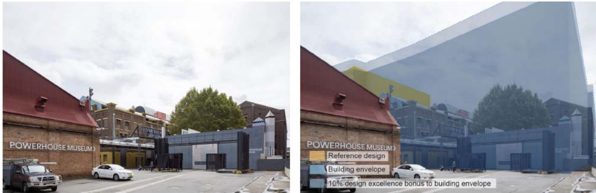
Figure 3: Before (left) and after (right) views of the visual impact from the Goods Line. This primary view of the site, and the location of the proposed new entry, is assessed as being of low significance, and showcasing the former Post Office. (Visual impact Assessment)

Another example is the view from Pier Street which describes (p.46) the “almost monumental, large scale and bulk of the Powerhouse” which is “visually dominant”, yet then concludes (p.65) that this same view has “negligible” significance and an “imperceptible” magnitude, with the planning envelope having a “perceptible” impact. Despite being taken from the roadway (itself being the way most people will view the site from this location) the report mentions the “distracting nature of the elevated road viaduct in the foreground”.