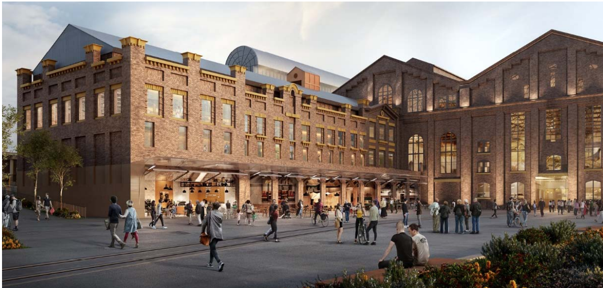
Figure 2: The main promotional image of the Powerhouse Renewal project, assessed as being a place where “a medium number of people” will see the view of the museum.

Most aspects of the Visual Impact Assessment are confusing as to whether this is an analysis for the existing or proposed conditions. For example, the view from the Goods line (p.51) notes that “a medium number of people will see the view... including a small number for tourism purposes” and that “their level of interest or attention in the view is expected to be medium.” This, despite this viewpoint being the focus of the proposed main new entry to the building and the dominant image used on all report front cover pages.