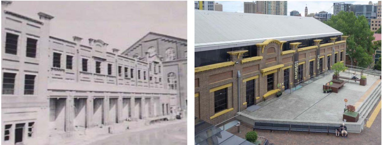
Figure 7: No idea... the Draft CMP does not provide any advice on how the Switch House has been impacted by later changes and how this could be dealt with. This is clearly a prominent part of the site that any design team will have to deal with.

The assessment of the Wran Building (section 15) is even more concerning. There is no comprehensive description of the original building plan, or the changes that have been made to it. The Draft CMP does not even include original architectural drawings for the building but instead (p.273) relies on some old photocopied elevations that are referenced to the National Trust! Surely a comprehensive CMP team could have located and included the original architectural plans which are readily available from various public archives, let alone the Powerhouse's own collection. While every single other part of the site, including the Water Cooling System, is provided with a "Summary of Significance", an individual "Grading of Significant Components", a "Views Analysis" and a "Significance Grading" drawing produced by John Wardle Architects, the Wran Building is not provided with any of these assessments. Its interior is not assessed at all.