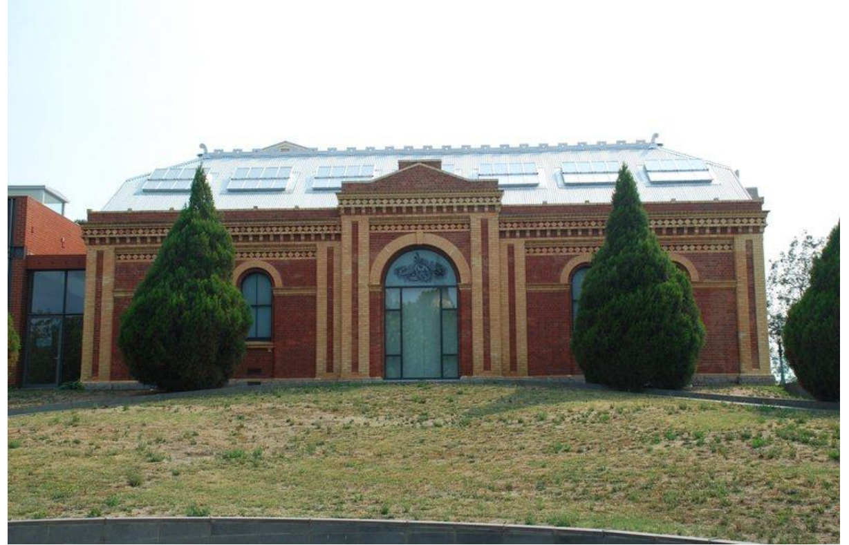
The Bendigo Art Gallery is on the Victorian Heritage Register, H1172.

The closure of the Bendigo Art Gallery for two years is a decision that needs further consideration.