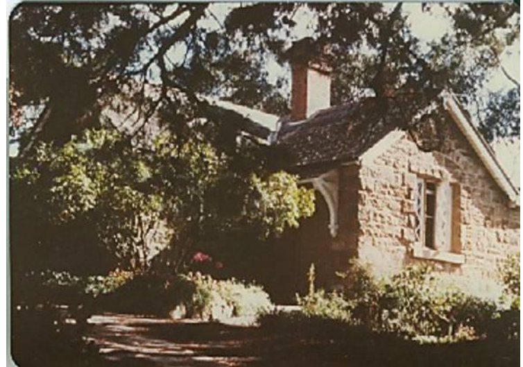
The adjacent Powder Magazine Keeper's Cottage (also called Whitley's House) 47 Farnsworth St Castlemaine, NT Register No. B1976.

"We thought that the townhouses were totally contradictory to the heritage nature of the area," she said. "It's a heritage precinct. There's also The Old Powder Magazine's keeper house, which has got military significance and national significance. There are quite a few very important buildings in the nearby precinct."