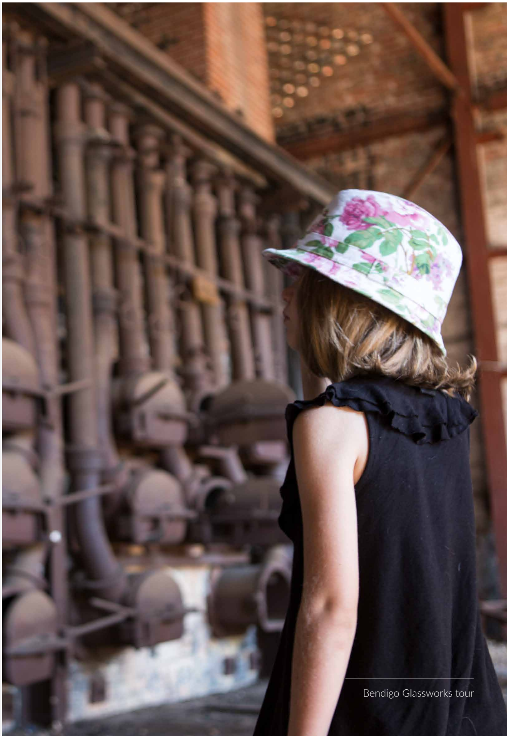
Bendigo Glassworks tour