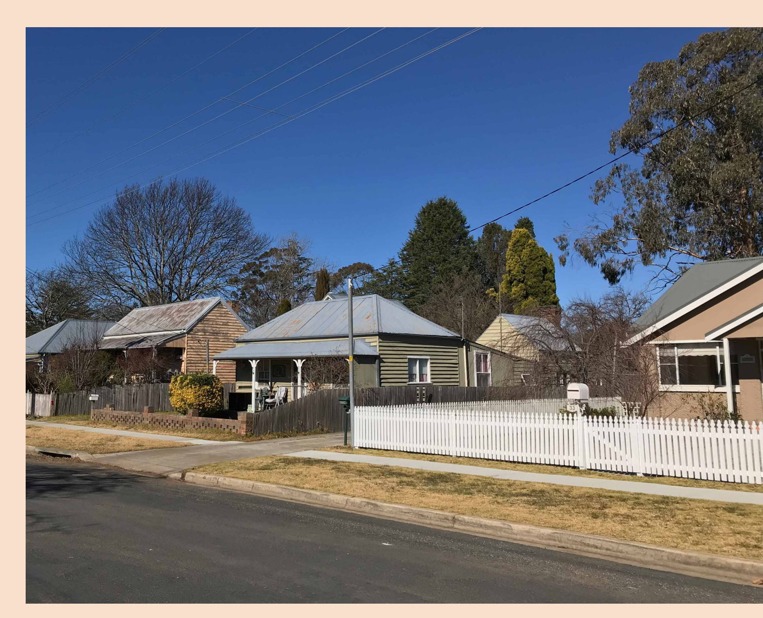
Historic cottages, Victoria Street, Bowral

Local Government plays a vital role in protecting regional diversity by identifying, promoting, incentivising and regulating the protection and celebration of local heritage.