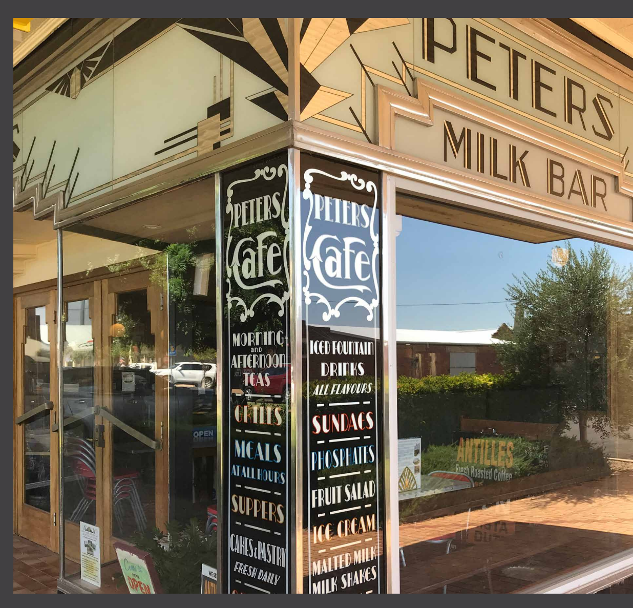
Roxy Theatre, Bingara, NSW

Email: info@nationaltrust.com.au nationaltrust.org.au/nsw