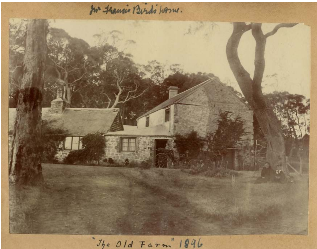
Early photographs 1858 and 1896