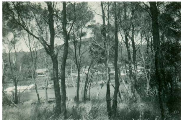
David Bird green album collection NTWA

Tender closing date: 9am WST Monday 14 September 2020