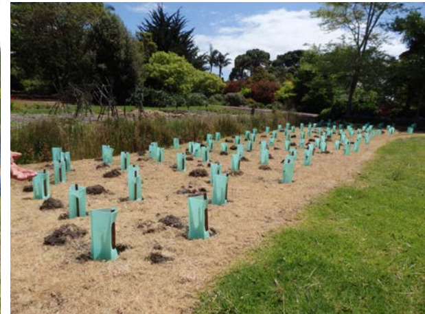
Heritage wheat varieties on vacant lot (no longer extant) and creek revegetation