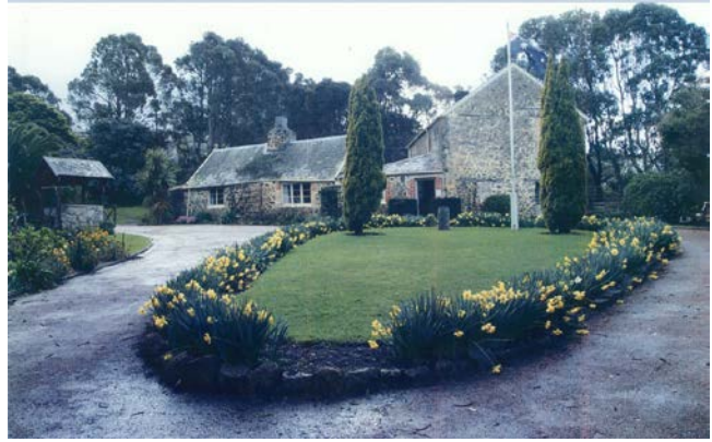
National Trust late 20th century