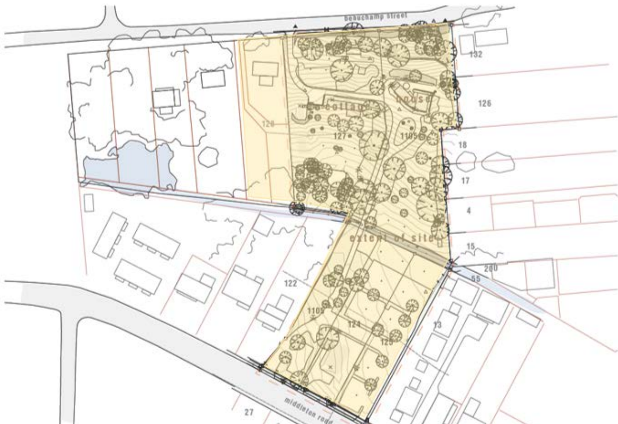
Site plan showing National Trust managed land