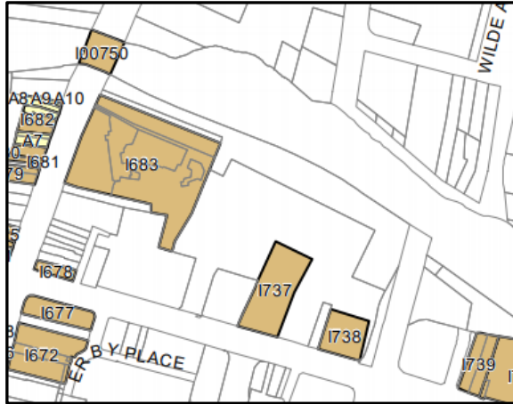
B: Heritage Map if demolition of Willow Grove and St George's Terrace were to occur