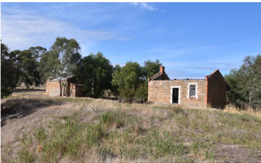
The Ravenswood cottages in 2019

Ravenswood Cottages- The Branch has been working with DELWP over the past 12 months to preserve these stone buildings that probably date pre gold rush. Currently a new roof is going on one of the cottages. At a meeting last week it was decided to form a Management Committee for the site. The Branch is interested to talk to people who have a knowledge of the site so that a nomination can be prepared for it to be added to the State Heritage Register.