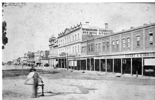
Pall Mall Bendigo ca. 1890