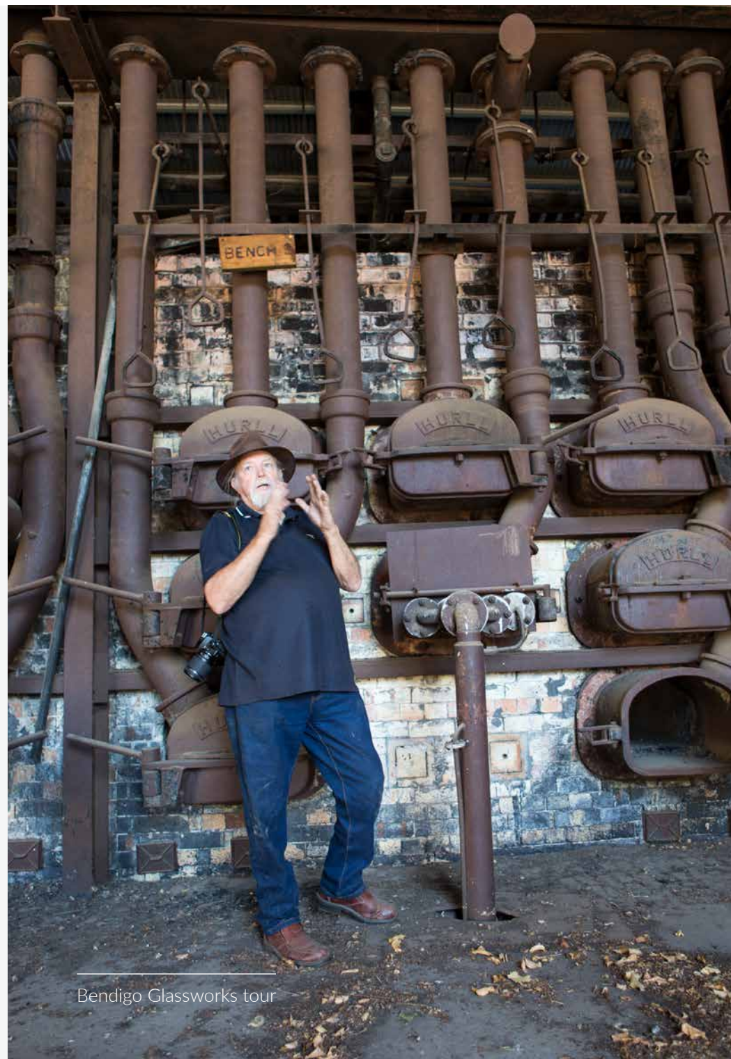
Bendigo Glassworks tour

The Australian Heritage Festival created a national platform for exhibitions, walking tours, films, expert talks, workshops, food fairs, guided tours of historical sites, ceremonies, demonstrations, special dinners and lunches – and much more.