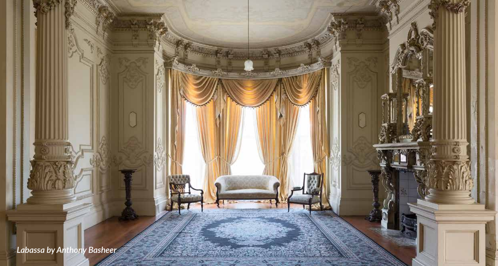
Labassa