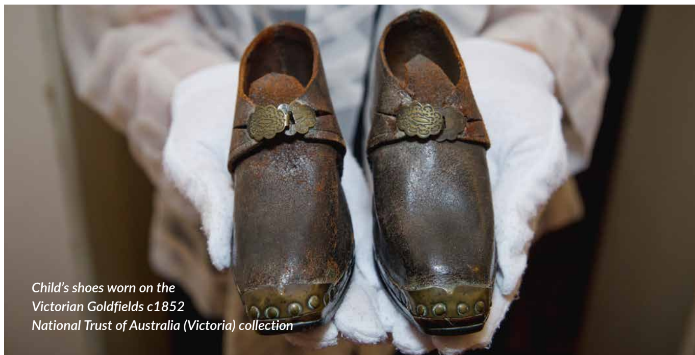
Child's shoes worn on the Victorian Goldfields c1852 National Trust of Australia (Victoria) collection