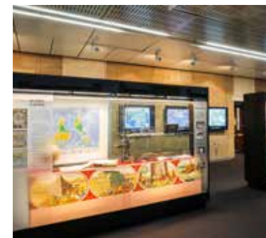
Cartographica – Sydney on the Map