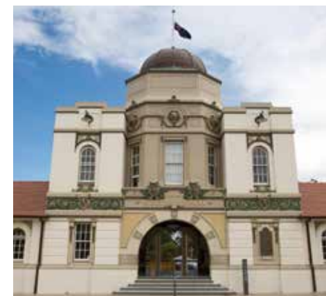
Taronga Park Zoo