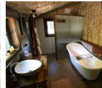
Oldbury Cottage Conservation Berrima