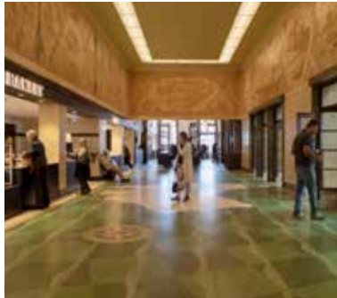
The Melocco Room

Conservation and reinstatement of WWI Honour Boards Transport Heritage NSW in partnership with Sydney Trains, Art and Archival, Anton Büchi & Sons and Australian Railways Historical Society (NSW Division)