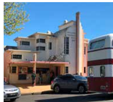
The Malachi Revival

Cartographica – Sydney on the Map City of Sydney, Customs House