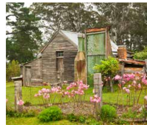
Davidson Whaling Station