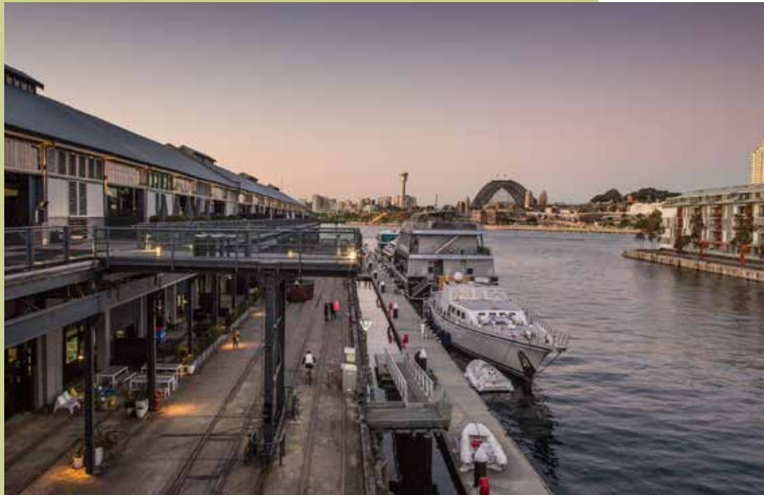
The National Trust Heritage Awards is announced at the heritage-listed Jones Bay Wharf in Pyrmont, Sydney.

The annual awards ensure that the various industries, specialist heritage skills and areas of knowledge dedicated to safeguarding and continuing the stories of our past are acknowledged, recognised and celebrated.