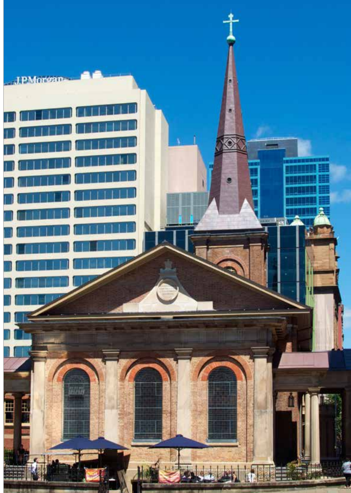
St James Church, Sydney