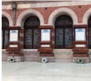
NSW Railways Remember