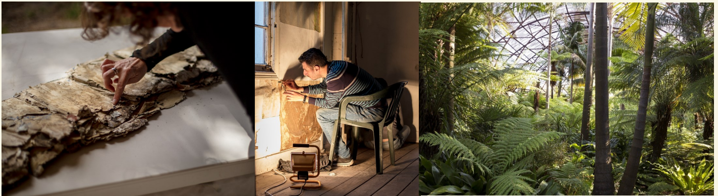
Images: The loss of traditional skills and threat of climate change are urgent threats to Australia's heritage

The decline and disappearance of traditional heritage trade skills presents a significant threat to our continued ability to conserve and restore historic sites. The use of traditional trades is essential for achieving high quality conservation of culturally significant places in accordance with the Australia ICOMOS Burra Charter . A systematic program of training which links existing practitioners with willing participants in delivering detailed skills training is needed.