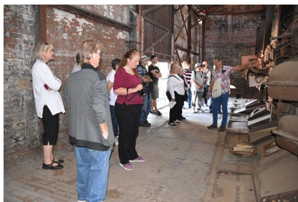
The Bendigo Gas Works Tours were booked out well in advance.