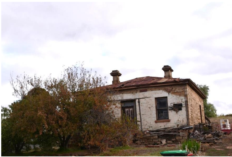
A Bendigo property falling into ruin

https://www.nationaltrust.org.au/initiatives/demolition-by-neglect/