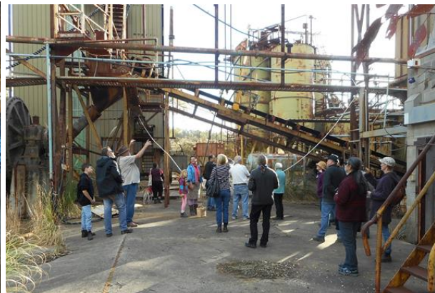
Old and new technology at the Wattle Gully Gold Mine.