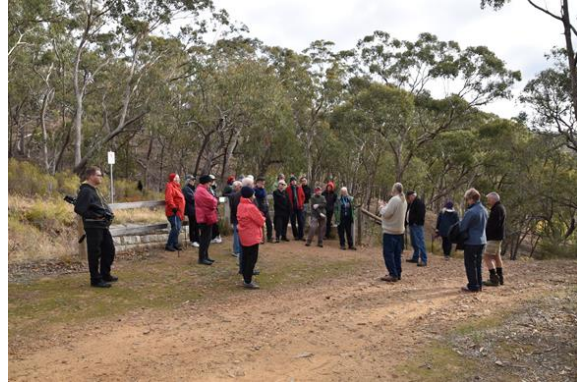
The Coliban Main Channel Bus Tour proved popular in spite of the cold weather.