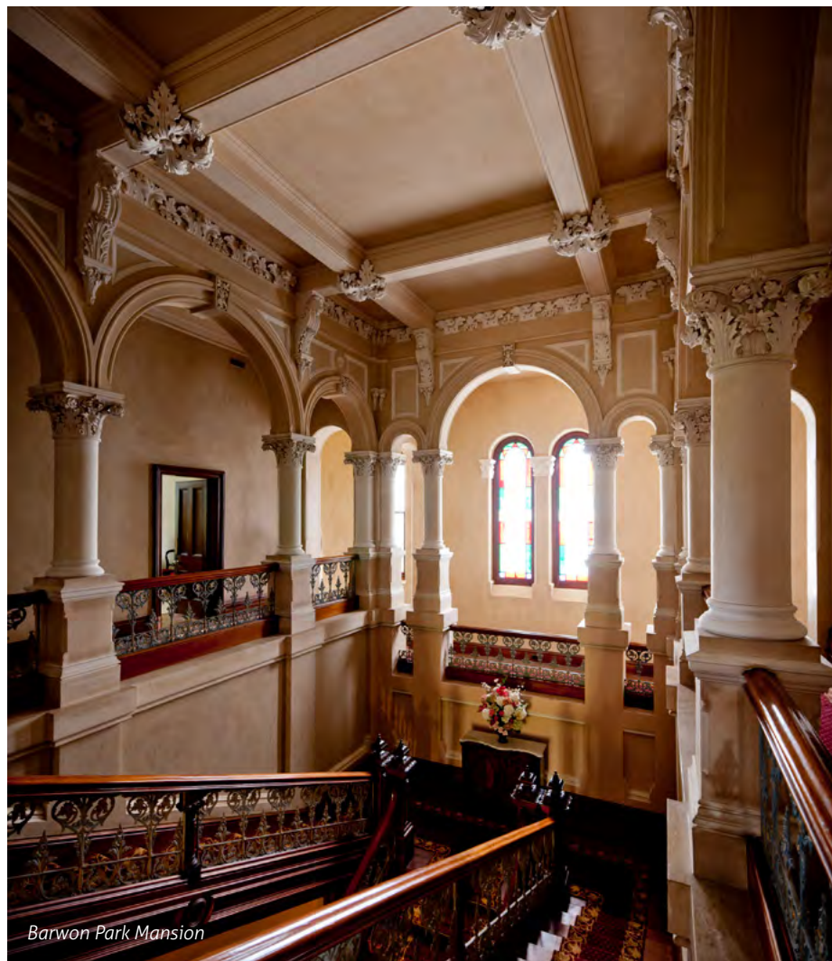
Barwon Park Mansion

Cover image: Labassa Mansion