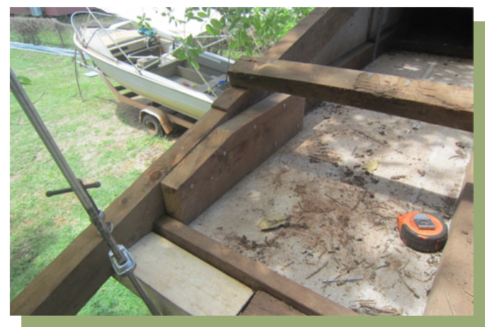
Timber corner splice details prior to bolting