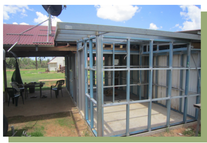
Renovations by Cairns Industries (kitchen, bathroom & storeroom) in Old Welfare Building

We look forward to a terrific year in 2018!