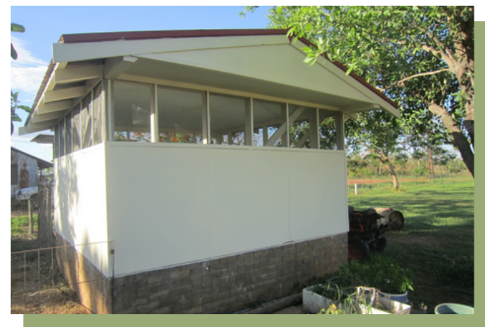
Good for another ten years