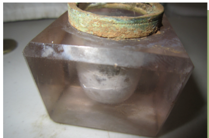
Purple Glass Inkwell

Latest addition to our collection is a purple glass inkwell found at the Old Court house site.