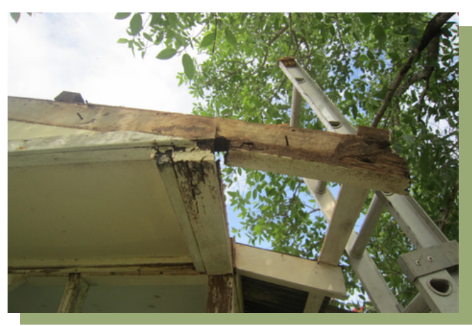
North West corner after removal of fascia of the Old Borroloola Meat House