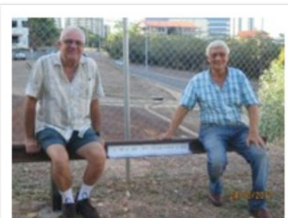
The two Trevors on the Rail Track Exhibit