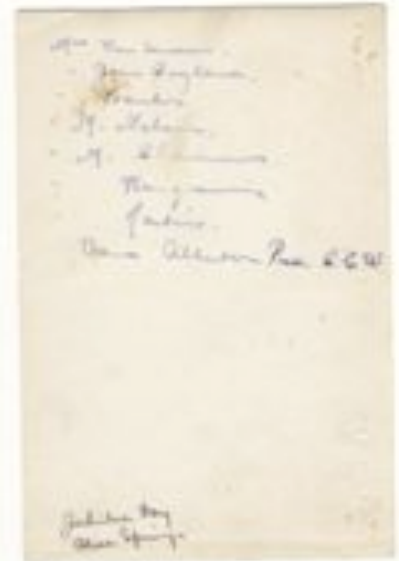
Country Women's Association Photo, front and back.