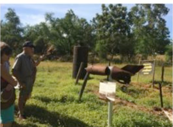
Daisy Cutter, bomb and crater