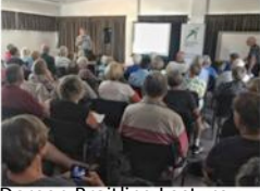
Doreen Braitling Lecture