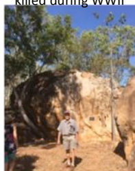
Site where one person was killed during WWII