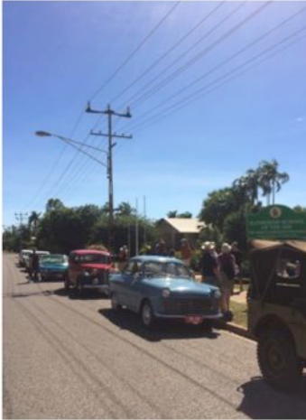
Line up of the vintage cars outside School of the Air

On Saturday morning 29th April observers might have thought that Katherine had returned to an earlier era as old restored vehicles lined up along Riverbank Drive outside O'Keeffe House. Their presence signaled the annual Heritage Tour of Katherine's historical sites.