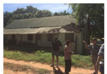
Old Gallon Pub, Knotts Crossing