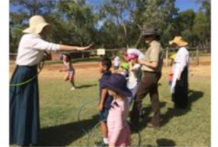
at the Telegraph Station