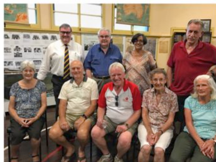
People who attended The Voice of Local Government in Alice Springs Today