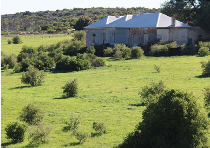
VIEW FROM NORTH-EAST