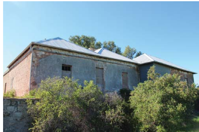
VIEW FROM SOUTH-WEST