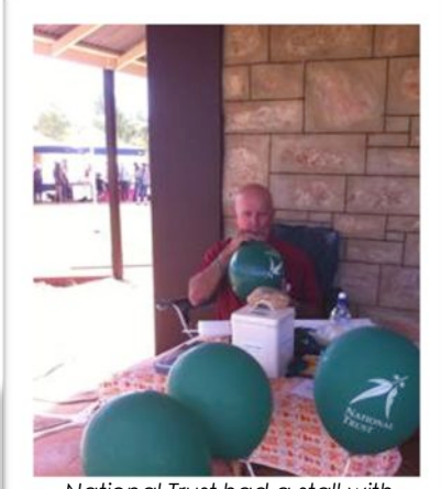
National Trust had a stall with balloons for children for a donation

Although different from previous nighttime events, this was a lovely afternoon, at the Telegraph Station Precinct with the historic buildings open to the public, market stalls, historical groups, a blacksmith and some old working engines and games for the children, which was well attended.