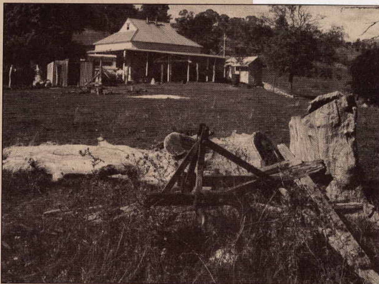
Farrer's laboratory where the Federation strain of wheat was developed