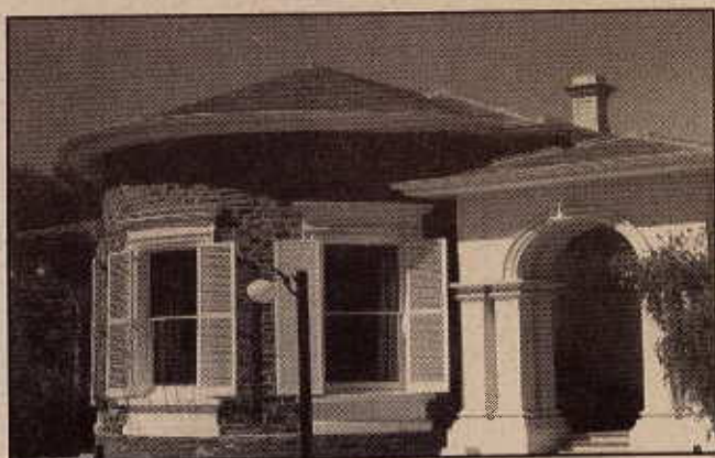
The Bay Window of the large Dining Room, Ayers House

Ayers House is one of the last remaining grand 19 th century houses, built at a time when the Colony was booming with the massive wealth derived from the copper mines on York Peninsula.