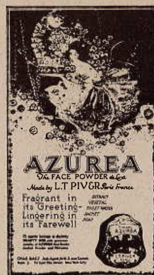
Everybody's Magazine, May 1920

It is with a sense of achievement that the First Canberra Scout Group, which survived the Great War (1914-1918), the world wide depression in the early 1930s and the Second World War (1939-1945), is still a viable and active group in 1997 and is looking forward to the challenges of the 21 st century.