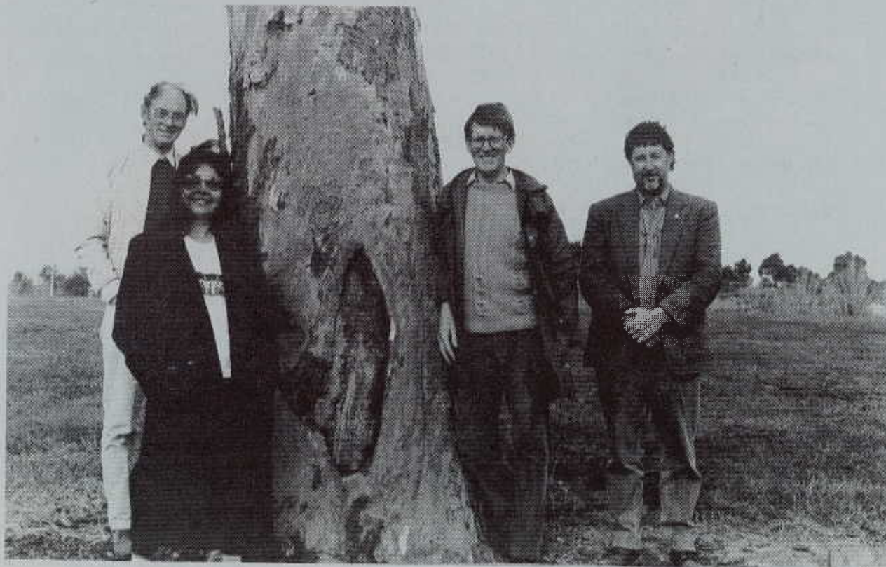
'Shield Tree', Wanniasa, June 1991