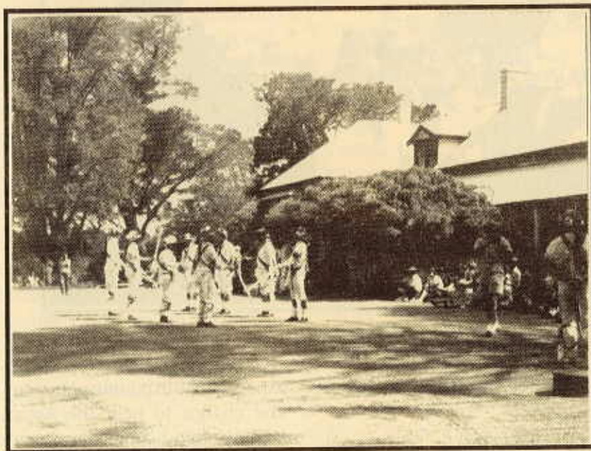
Morris Dancers in front of Lanyon Homestead.