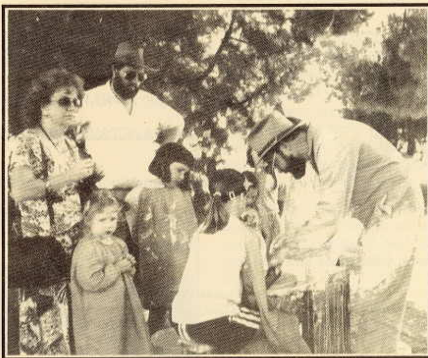
The Administrator getting his hands dirty at the Spring Fair