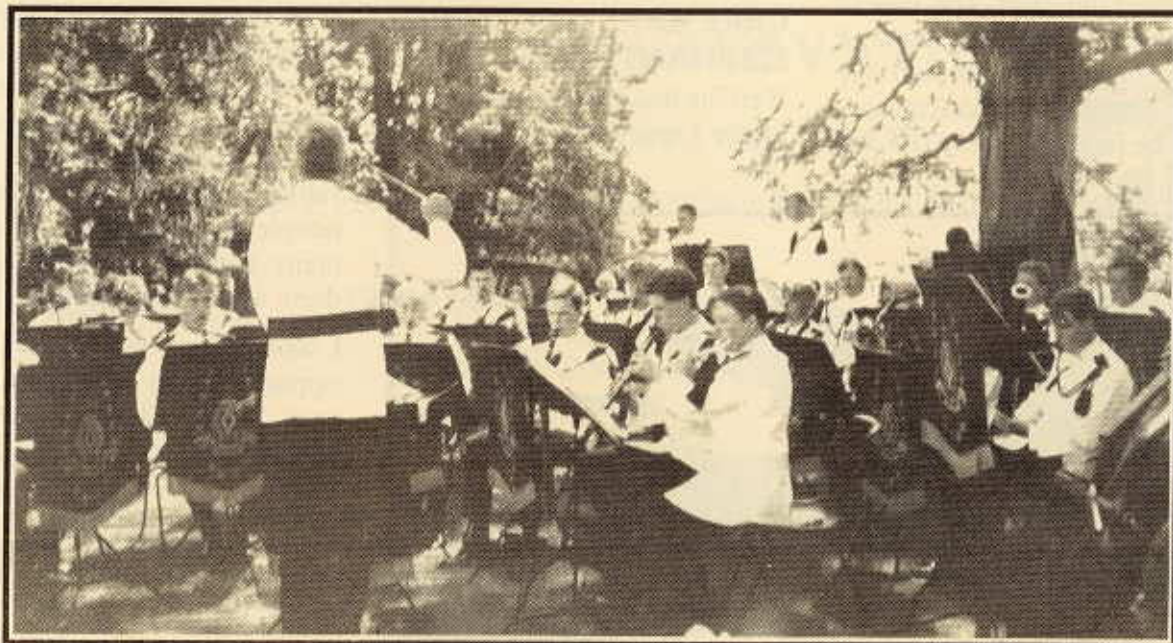
The Duntroon RMC Band

The Refreshment Stall had plenty for hungry and worked in conjunction with the Canberra