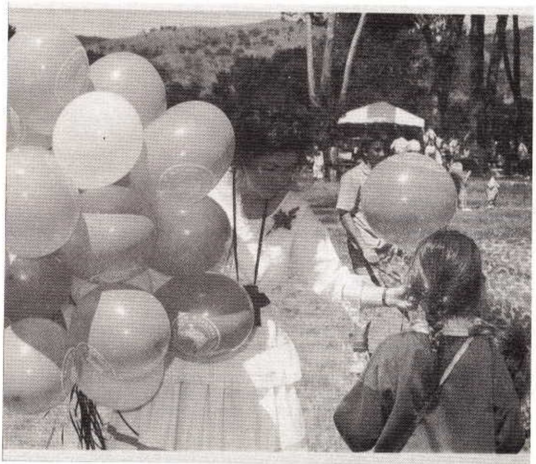
ABOVE: Giving away balloons at the 1989 Country Spring Fair.