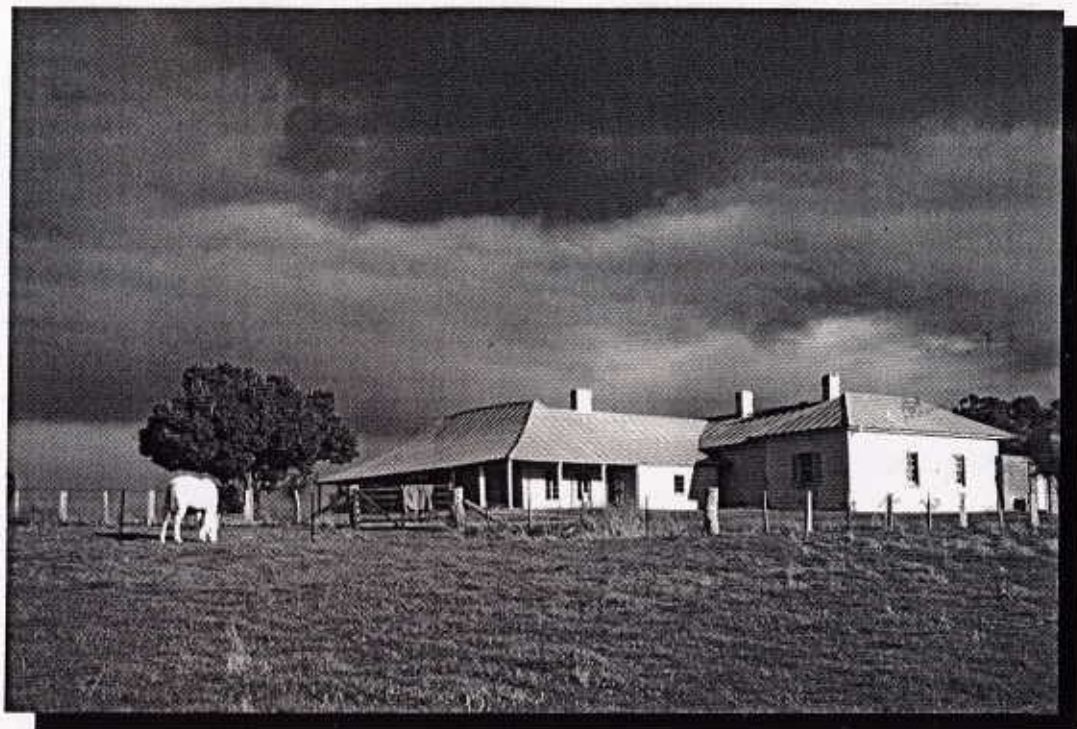
Cooma Cottage, Yass.