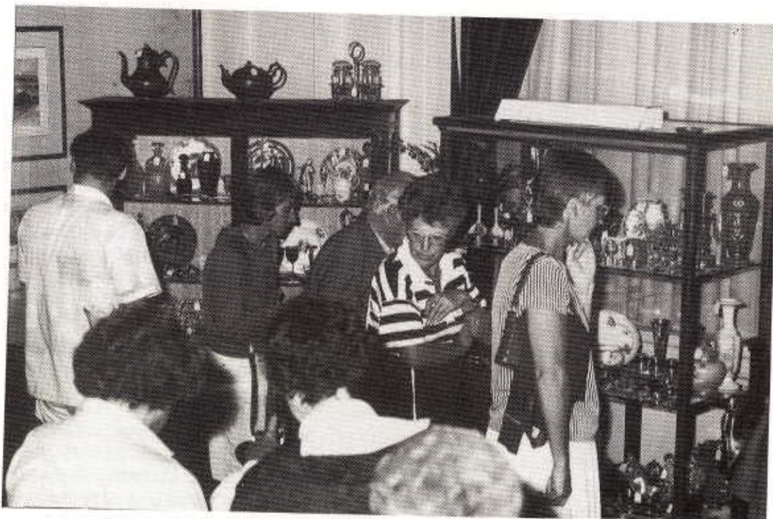
ABOVE: Visitors to the 1988 Canberra Antique Fair at the Albert Hall