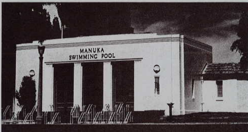
Manuka Pool - Classified by the Trust in 1981

Delicious sweet pancakes (choice of Bavarian Apple or Hot Buttered Walnuts) and tea and coffee will be served in Telopea Park at the conclusion of the tour. Cost : Members $12.00; Non-members $14.00; Young Trust $10.00. Application form included in this newsletter. Numbers limited to 30. Participants are advised to dress sensibly for the weather at the time (it may be quite chilly/windy) and wear comfortable walking shoes. Participants will receive a programme giving further details closer to the date of the walk.