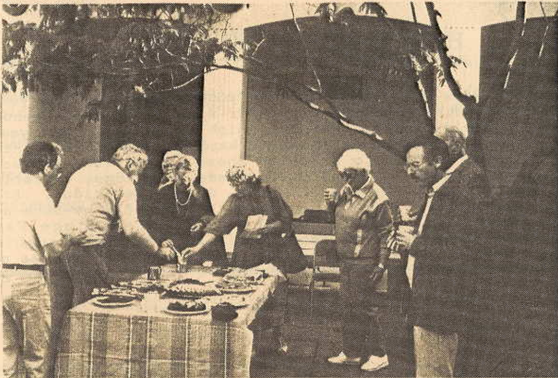
AFTERNOON TEA IN THE FILM & SOUND ARCHIVE COURTYARD