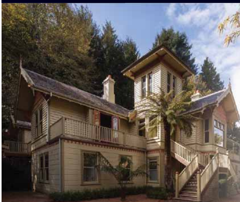
'Korori' - Mt. Macedon