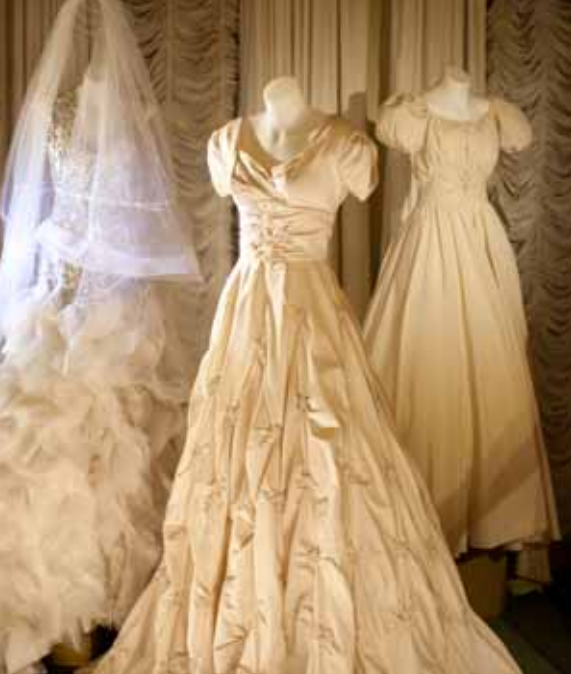
Gowns from Love Desire & Riches exhibition (National Trust of Australia (Victoria) collection)