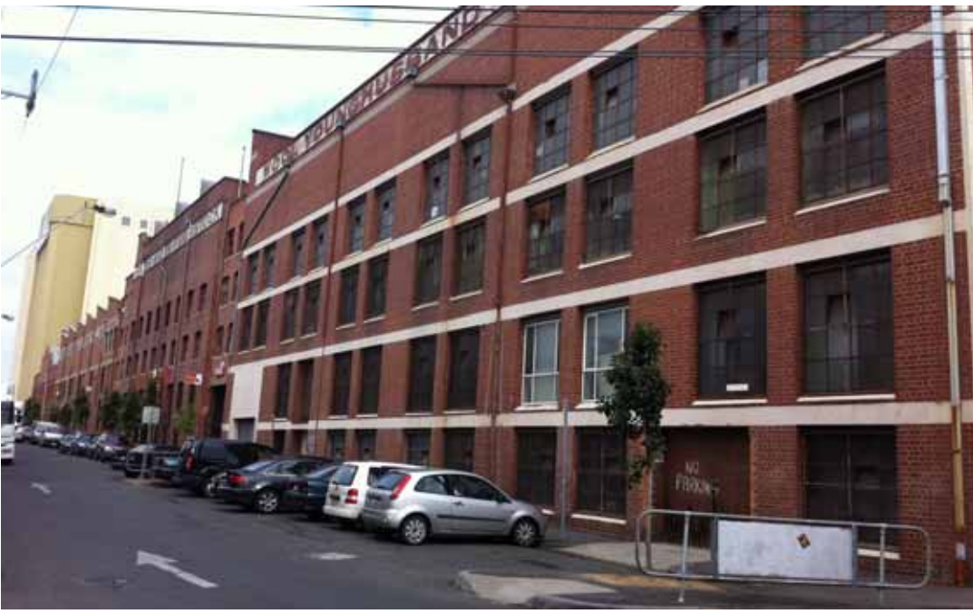
(From left to right) Total Carpark Russell Street 1966 Bogle and Banfield, Younghusband wool and grain warehouses, Kensington

panel in November against a number of objections. The precinct is of economic, social, historical and architectural significance as it represents the height of the growth of Victoria's wool and grain industries.