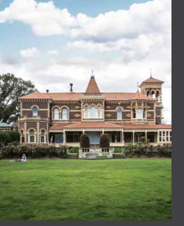
Rippon Lea's new roof