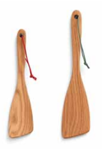
Oak Turner Set $26.00