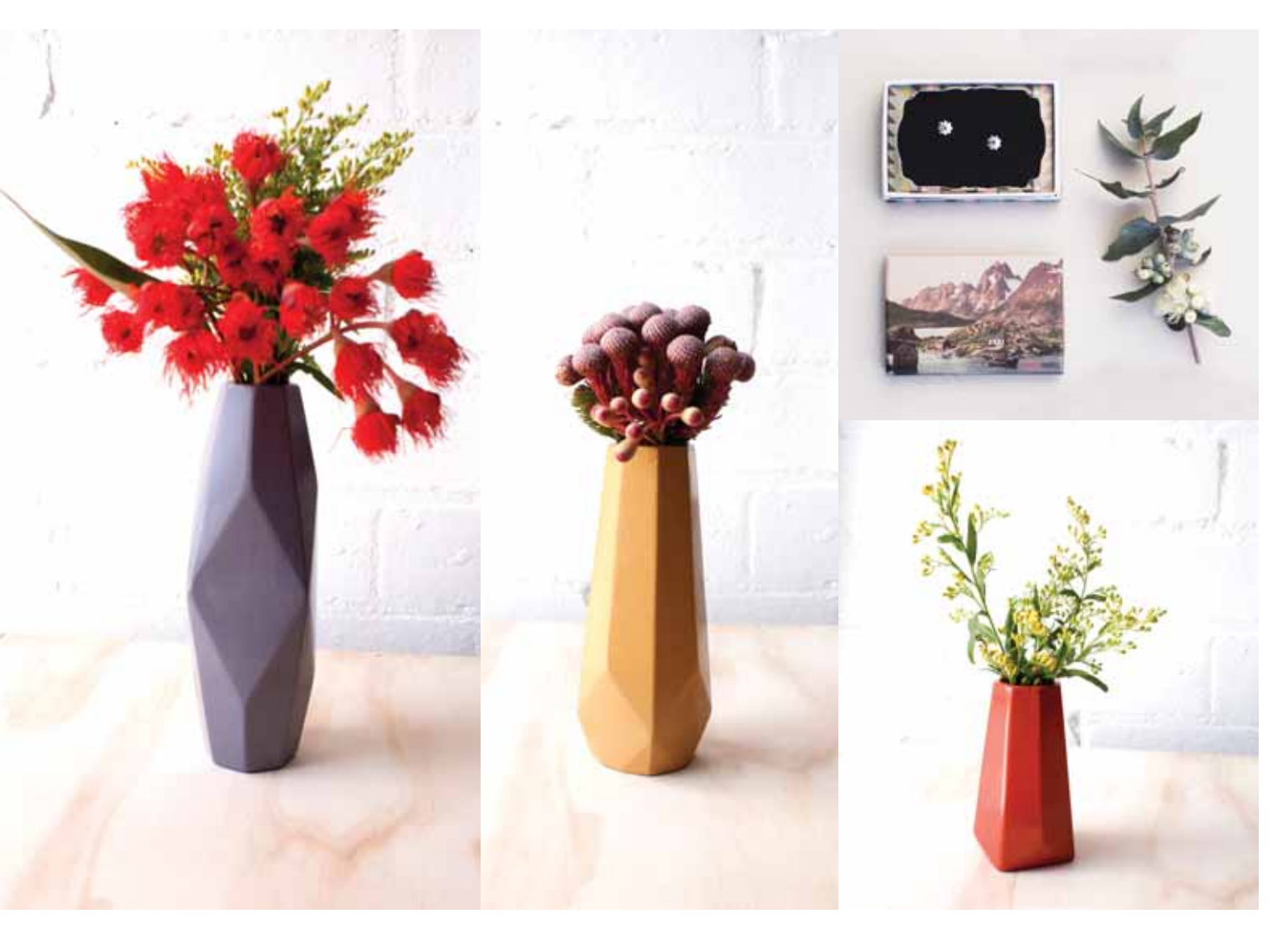
(left to right) Ceramic Vessel in Large $35.00, Ceramic Vessel in Medium $30.00, Royal Stars Earrings $49.00, Ceramic Vessel in Small $25.00.