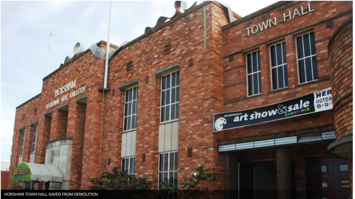
HORSHAM TOWN HALL SAVED FROM DEMOLITION