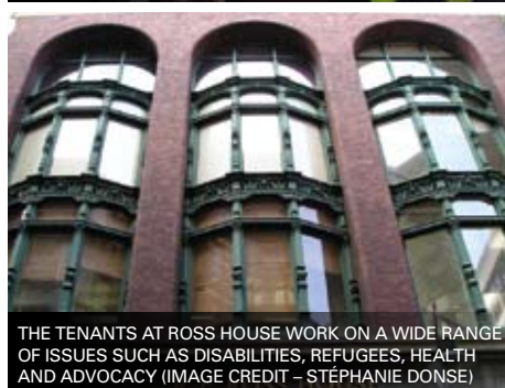
THE TENANTS AT ROSS HOUSE WORK ON A WIDE RANGE OF ISSUES SUCH AS DISABILITIES, REFUGEES, HEALTH AND ADVOCACY