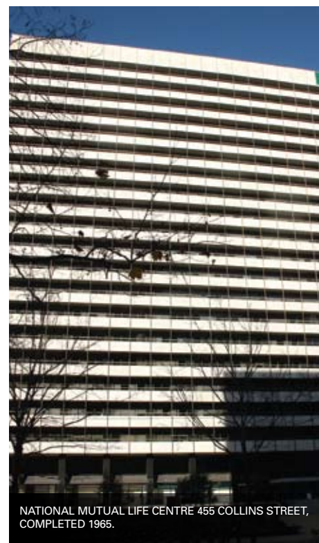
NATIONAL MUTUAL LIFE CENTRE 455 COLLINS STREET, COMPLETED 1965.