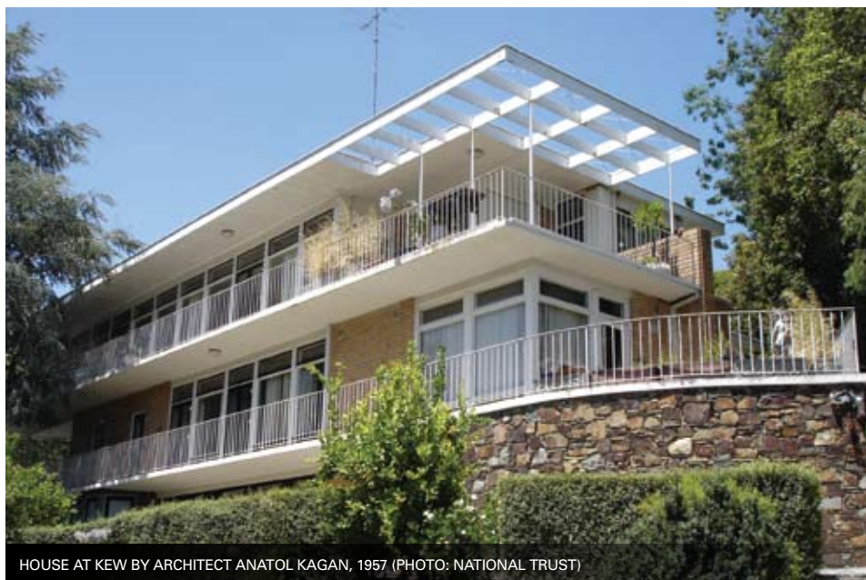
HOUSE AT KEW BY ARCHITECT ANATOL KAGAN, 1957

In June the City of Boroondara received and noted the outcomes of the consultation process undertaken on the draft Assessment of Heritage Precincts in Kew study, and has