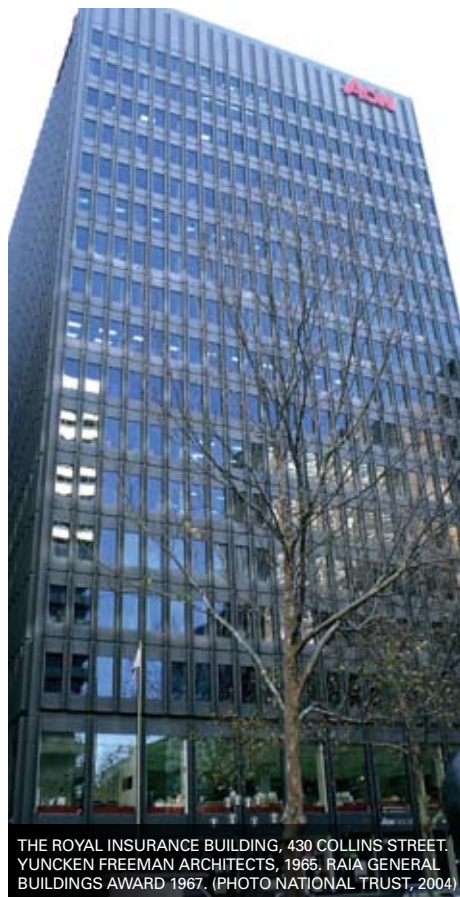
THE ROYAL INSURANCE BUILDING, 430 COLLINS STREET. YUNCKEN FREEMAN ARCHITECTS, 1966. RAIA GENERAL BUILDINGS AWARD 1967.

lines. Only a handful have been protected through a Heritage Overlay (eg. Auburn Village and Maling Road), while others have interim controls and are waiting for a panel process (Glenferrie Road/Burwood Road and Hawthorn Village).