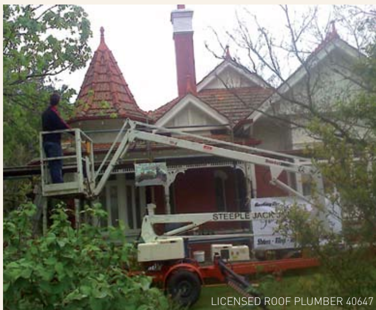
LICENSED ROOF PLUMBER 40647