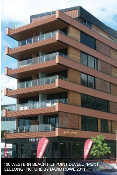
100 WESTERN BEACH PIERPOINT DEVELOPMENT GEELONG

Hallan Whittle of Canadian Shingle Fixers for work at St Johns Anglican Church, Sorrento (specialist roofing skills)