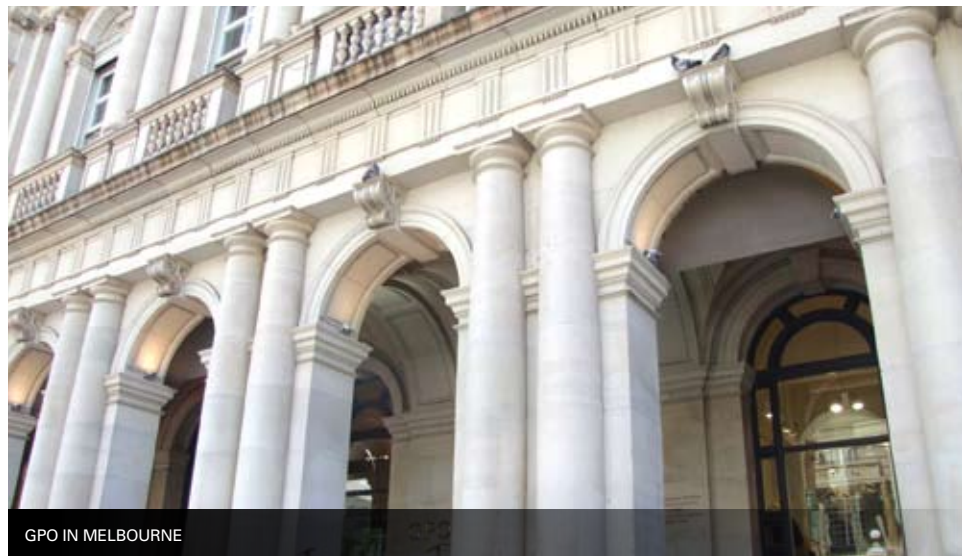
GPO IN MELBOURNE

One of the biggest misconceptions in the community is that statutory listing (inclusion on VHR or heritage overlay) means that change cannot occur. Listing is about managing change to retain heritage values whilst enabling it to be economically sustainable. The two sides of developing a heritage place, conservation and change, are not necessarily incompatible, and indeed change and development is often necessary to enable redundant places to be conserved and retained. Without new uses these places would deteriorate and their heritage values would be lost.