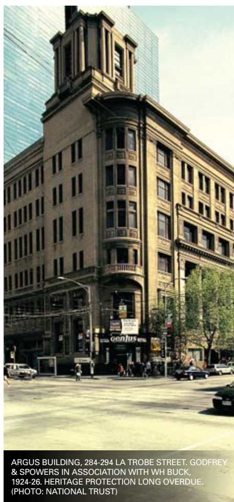
ARGUS BUILDING, 284-294 LA TROBE STREET. GODFREY & SPOWERS IN ASSOCIATION WITH WH BUCK, 1924-26. HERITAGE PROTECTION LONG OVERDUE.

Heritage is one of the defining characteristics of much of the City of Boroondara, and there are numerous strips and clusters of fine Victorian and Edwardian and interwar retail buildings, especially in the eastern parts of the municipality and along the railway