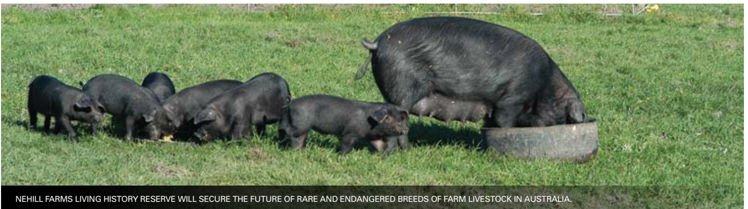
NEHILL FARMS LIVING HISTORY RESERVE WILL SECURE THE FUTURE OF RARE AND ENDANGERED BREEDS OF FARM LIVESTOCK IN AUSTRALIA.

For more information on Nehill Farm please visit www.natstrust.com.au