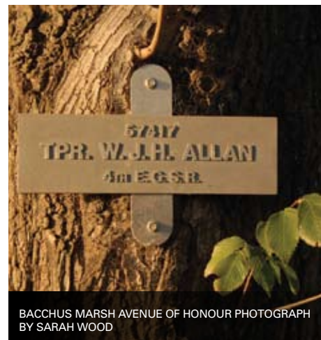
BACCHUS MARSH AVENUE OF HONOUR