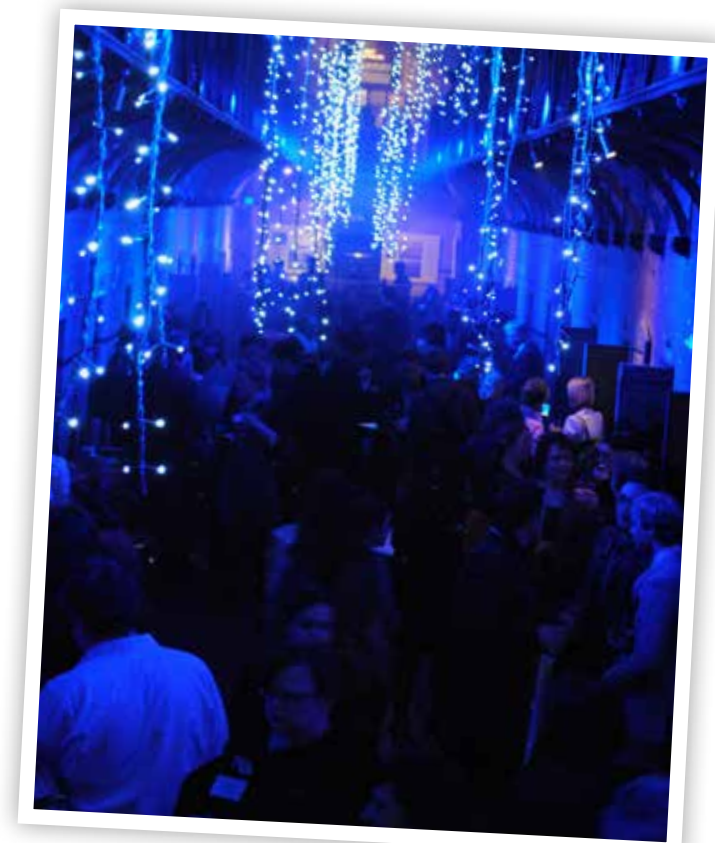
Old Melbourne Laol popup bar

This year investment, conservation and the development of innovative programs and events has promoted visitation, continuing to drive audiences and revenue. We strive to look after our special places and 2013-14 was no different. Supporting our dynamic programming we continued investment in capital works and staffing at our properties, reaffirming our determination to deliver best practice property stewardship.