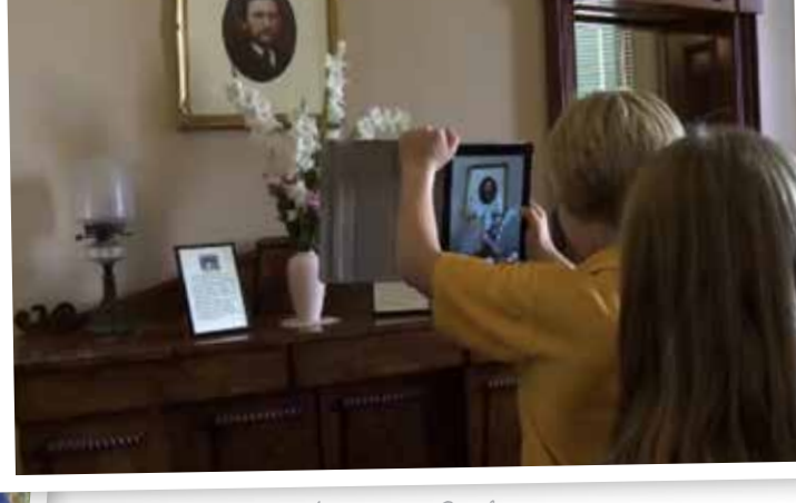
ory in Place at Barwon Park