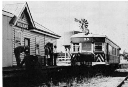
Last day of passenger service to Milang 30/11/68

The Sandergrove – Milang railway operated between 1884 and 1970 as an off-shoot of the Adelaide – Victor Harbor line. In the mid 1980s, local groups lobbied for its retention as a reserve because of its important native vegetation. Local volunteers commenced bush-care works in the area in 1987.