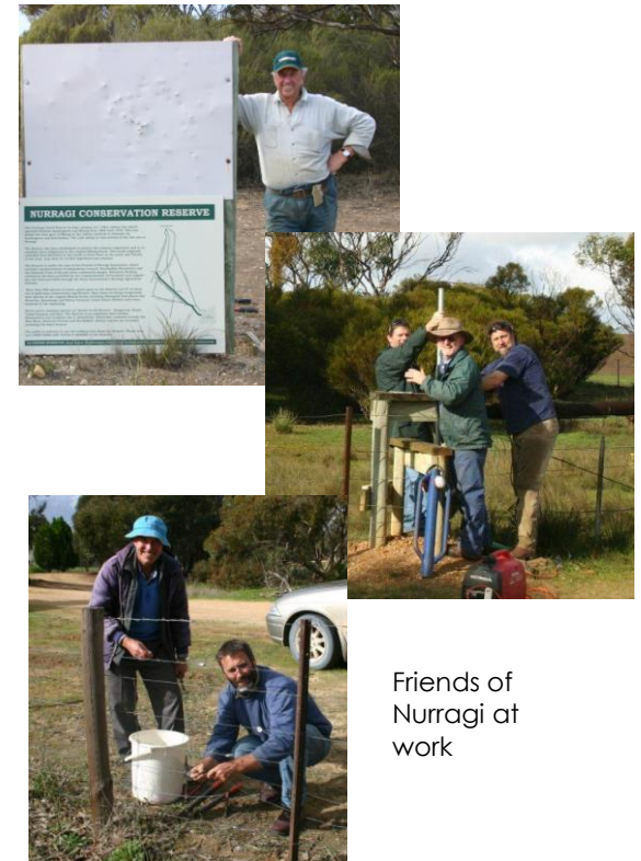
Friends of Nurragi at work

Revegetation of cleared areas along the Reserve has also been a priority through direct-seeding and tube-stock planting, the latter often involving local schools. In addition, with the support of Alexandrina Council and adjoining landholders, unused road reserves have been rationalised and sections of land added to Nurragi. These are being revegetated with local native species.