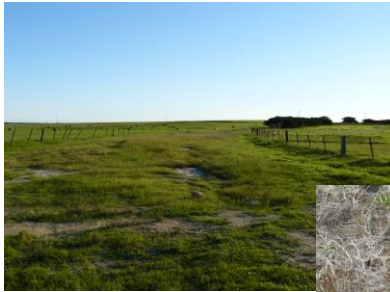
Previously cleared sections of Nurragi are being revegetated

Management of Nurragi has been supported by the Australian Government, the State Government (through the Heritage Agreement Grants Scheme), Alexandrina Council and the SA Murray Darling Basin Natural Resources Management Board. In recent years, there has also been significant support by SA Water, as part of its obligations under the Native Vegetation Act to offset the effects of vegetation clearance for water infrastructure elsewhere in the district. There has also been assistance through the Goolwa – Wellington Local Action Planning Association.