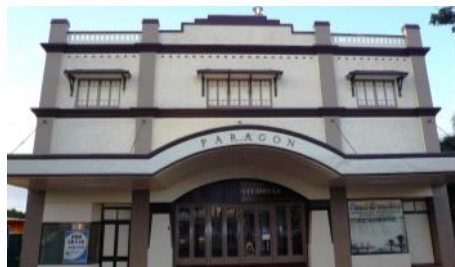
Paragon Theatre Childers

For conservation work to a 1920s regional theatre. The work included restumping, floor polishing, plumbing and repainting, as well as repairs to a termite damaged side wall and the theatre seats. Owned by members of the same family since 1962, the Paragon Theatre now serves as an entertainment centre for the community. It showed enthusiasm and engagement and recognised the place's social significance by reintroducing community uses. The project demonstrated an excellent approach to seeking good advice before commencing the extensive works, and an appropriate attitude to replacing like for like.