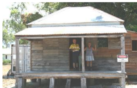
Resurrect Sunbeam House