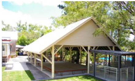
Brisbane Central State School, Play Shed repairs and refurbishment

For the conservation of the circa 1877, Suter-designed Play Shed at the Brisbane Central State School. Termite damage and generally poor conditions prompted lifting of the structure, re-instatement of the missing eaves, new lights and a repaint. A disabled accessible topping slab was also poured to facilitate connections with the 1950s section of the school. With these important Queensland structures becoming increasingly rare, projects like these demonstrate that conservation and adaption is certainly attainable.