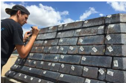
Power House Chimney Stabilisation

Awarded to: Accommodation Office, Department of Housing & Public Works Building and Asset Services, Department of Housing and Public Works Kane Construction Pty Ltd Office of the Governor