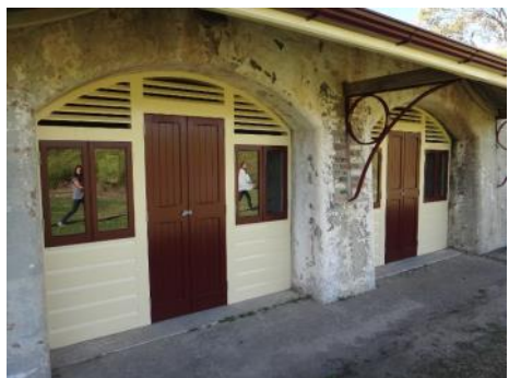
Fort Lytton Magazine Conservation Project

Brisbane City Council, Kane Constructions, Aurecon, Tanner Kibble Denton Architects