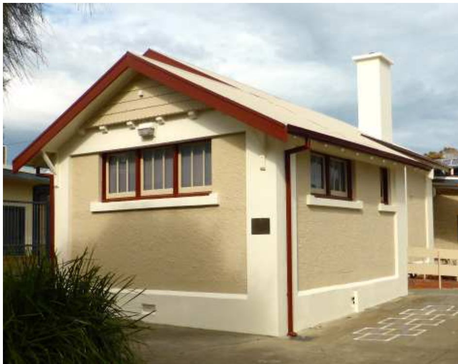
COMPLETED RESTORATION AND HERITAGE COLOUR SCHEME