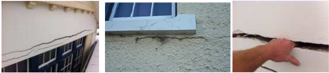
DETAIL SHOWING STRUCTURAL DETERIORATION