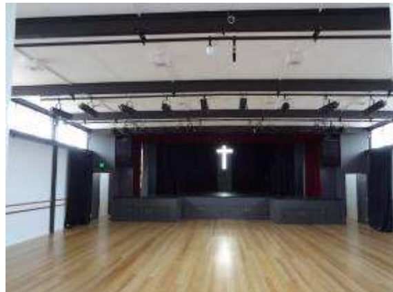
INTERIOR RESTORED BELLAMY HALL