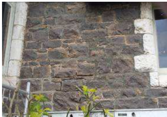
DETAIL SHOWING DETERIORATION OF MORTAR