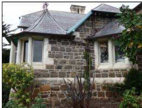
VIEW OF RESTORED AREA

DIGGERS GARDEN & ENVIRONMENT TRUST IN RECOGNITION OF THE ONGOING CONSERVATION WORKS AT HERONSWOOD HISTORIC HOUSE, DROMANA AND