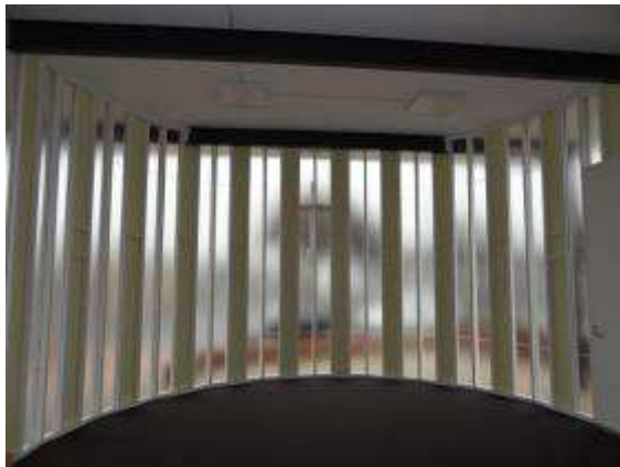
INTERIOR RESTORED ALBERT ROOM