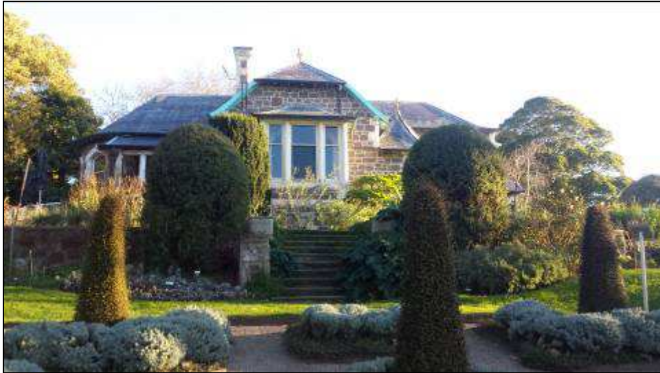
HISTORIC HERONSWOOD , LA TROBE PARADE DROMANA