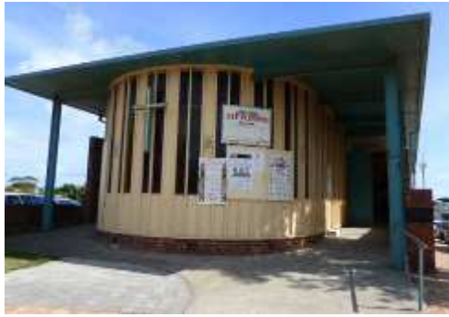
BEFORE RESTORATION (NOTE IN-FILLED PANELS AT BASE OF WINDOWS)