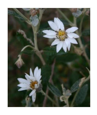
... from Railway Line to Nature Reserve...