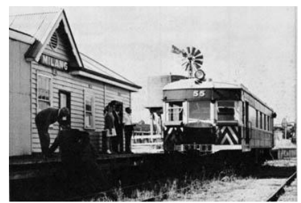
Last day of passenger service to Milang 30/11/68

The Sandergrove – Milang railway operated between 1884 and 1970 as an off-shoot of the Adelaide - Victor Harbor line. In the mid 1980s, local groups lobbied for its retention as a reserve because of its important native vegetation. Local volunteers commenced bush-care works in the area in 1987.